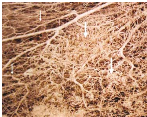
Figure 1 Architectural difference between vasculature in normal (small arrows) and tumour tissue (thick arrows).

Combretastatin A4 phosphate is a water-soluble prodrug of combretastatin A4 (CA4). Following administration, CA4P is rapidly cleaved to CA4 and binds tubulin at or close to the colchicines-binding site (McGown and Fox, 1989). One of the first in vivo studies showed rapid, extensive and irreversible vascular shutdown and haemorrhagic necrosis following a single dose of CA4P. A pronounced and sustained reduction in functional