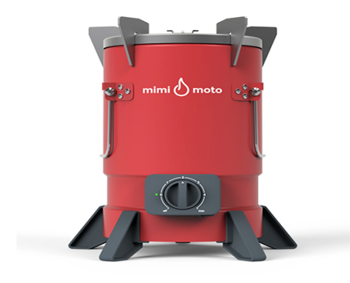
Intervention stove 3: Electric Induction stove