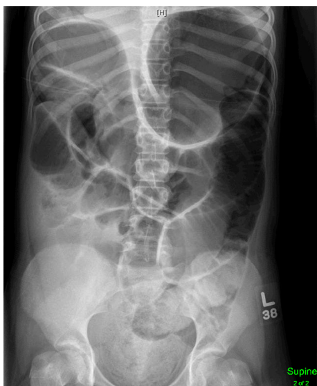
Figure 1. Abdominal radiograph, obtained supine on December 31, 2012. Markedly distended small and large bowel loops are shown. A large amount of stool is seen in the rectum, suggestive at this time of fecal impaction.