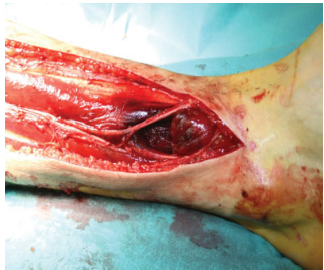
Fig. 2 Due to compartment syndrome, full-length fasciotomy of the anterior and peroneal compartments was performed. The peroneal nerve had a slight hourglass-shape at the site of the entrapment. The muscle belly of the peroneus tertius muscle was totally ruptured.

ankle. The dorsiflexion of the ankle was 10 degrees decreased compared with the healthy side. No deformity was present, although some wasting persisted in the area, observed as a small pit in the ankle. The patient had resumed to physical activity without pain or discomfort. After a follow-up time of 3 years, no new treatments have been needed.