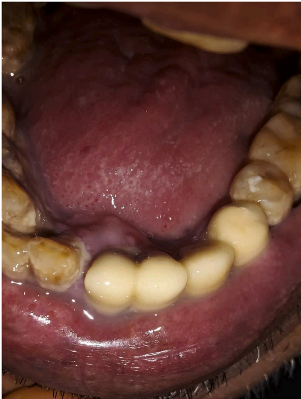
Fig. 1. The gingival lesion.