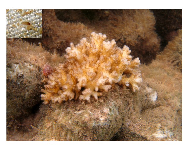
Figure 1. A Pocillopora damicornis colony on the reef in front of the Gump Research Station in Moorea, French Polynesia. The small insert shows a P. damicornis larvae on a mesh collection filter (100 \mu m).

In January 2010, 23 P. damicornis colonies (Fig. 1) were collected from fringe and back reef sites on the north shore of Moorea, French Polynesia. Colonies were transported to the Gump Research Station and kept in large seawater tanks (approximately 5 m<sup>3</sup>). A small nubbin (1 cm) was sampled from each colony and preserved in Guanidinium-Isothiocyanate (GITC) buffer for genetic analysis. Three days before the new moon (January 15th and February 13th), colonies were transferred to individual containers with continuous seawater inflow. The outflow of each container was diverted into a short PVC tube with a mesh filter (100 \mu m), where the larvae accumulated during planulation (Fig. 1). Larvae were collected using a 1000-µL micropipette and preserved individually in 200-µL GITC buffer (Fukami et al. 2004). Between January 17 and 20, colonies were monitored throughout the night from 19:00 to 06:00 h and larvae were collected and preserved as frequently as possible (i.e., every 2-3 h). In February 2010, planulation lasted from February 14 to