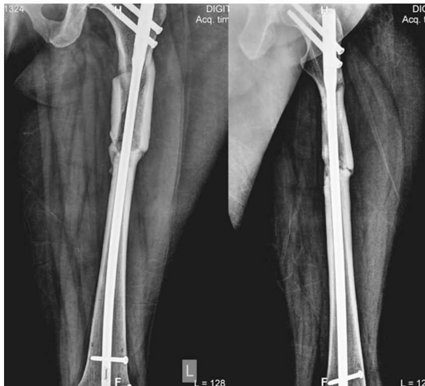
Fig. 6. X-rays anteroposterior and lateral views showing united left side segmental fractured femur with nail in situ at 6-month follow-up.

Bilateral femoral fractures associated with unstable pelvic fractures and visceral damage have been reported with a very high mortality and morbidity rate. These patients should be initially managed with the advanced trauma life support (ATLS) protocol 5,6 and once stable, surgical intervention should be considered. If the patient remains unstable the principles of damage control orthopaedics (DCO) should be followed. 6 This patient presented to us in a state of shock, thus priority for us was to stabilize the patient hemodynamically and once the patient was stabilized we proceeded for the definitive fixation of the fractures in staged manner, giving priority to femoral shaft fractures.