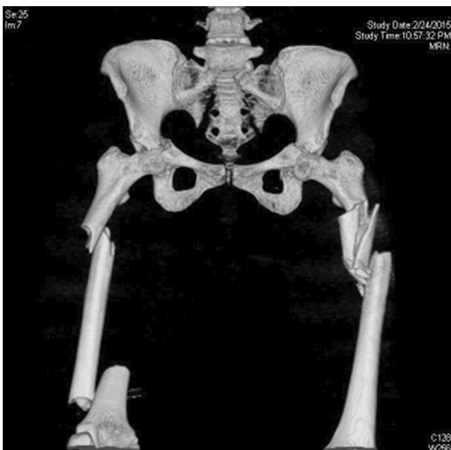
Fig. 2. 3-dimensional CT-scan showing bilateral segmental femur fractures, bilateral anterior column acetabulum fractures, and bilateral sacral fractures.

anterior column fractures of both the acetabulum were fixed with pre-contoured reconstruction plates through the bilateral ilioinguinal approach.