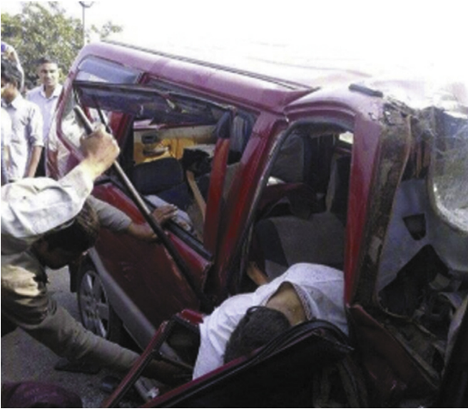
Fig. 1. Four wheeler at the site of accident, victims being extricated from the vehicle.