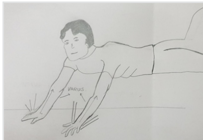
Figure 1: Mechanism of injury – type III Monteggia fracture.