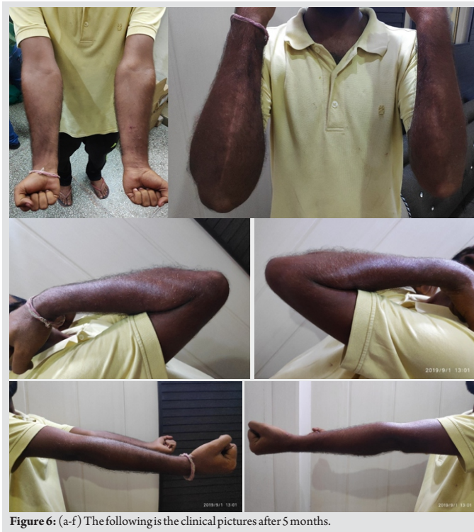
Figure 6: (a-f) The following is the clinical pictures after 5 months.

elbows which lead to bilateral ulna fracture with tension failure at radial side first and lateral radial head dislocation, thus leading to bilateral type III Monteggia fractures. Until the appearance of AO plates and stable osteosynthesis, these fractures were treated non-operatively by plasters. Following the rule, this kind of treatment resulted in a very poor function of the elbow and led to a subsequent disability of the patient. The appearance of AO plate provides stable osteosynthesis of fractures and early mobilization of the elbow; as a result, the complications are significantly rare [6]. In addition to plate, Ring et al. announce the use of zuggurtung technique to achieve a satisfactory stability of fracture [11]. The patient was operated with bilateral small locking dynamic compression plates for ulna and closed repositioning of radial head was done. There were no complications during the treatment. Both fractures healed in the same period. Arenas et al. describe nerve lesions in Monteggia fracture primarily of the anterior interosseal nerve, with spontaneous remissions [12]. Ring et al. describe lesions of n. interossealis posterior, n. medianus, n. ulnaris, or both nerves, which are rare and occur in the open Monteggia fracture