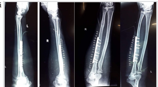
Figure 3: (qa-d) Post-operative images.

transition from metaphysis to diaphysis, distally to the coronoid process; in type IIC, a diaphyseal fracture is present; and in type IID, the fracture extends from the olecranon to the proximal half of the ulna. The appearance of AO plates and stable osteosynthesis marked the end of these fractures being treated conservatively and, at large, functional results after conservative treatment used to be very unsatisfactory [1, 5, 6, 7, 8]. Bilateral Monteggia fracture in adults is very rare. Kloen et al. [9] described a case with bilateral Monteggia fracture that had been treated surgically. Another case reported by Ristic et al. [1] described a case with bilateral Moteggia fracture which was also operated on, as in the patient that we presented.