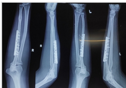
Figure 4: Follow-up after 1 month.

Fractures involving the proximal end of the ulna with the dislocation of the radial head are serious injuries, and their correct management still poses a challenge to orthopaedicians. Monteggia fractures are produced by the direct force, most commonly a blunt force when a person tries to defend themselves. Evans EM proved that the cause of the fracture may be forced pronation and forearm during the fall by testing it on cadavers [10]. Roadside accidents are the leading cause of Monteggia fracture in the recent era. The presented patient, a 35-year-old male, came to the emergency with alleged history of roadside accident. The patient was hit from behind by a speeding vehicle and with the impact was thrown onto the road with both outstretched upper limbs (to break the impact of fall) with varus force on both