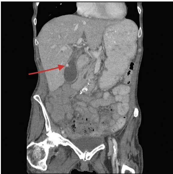
Fig. 1. CT axial portal venous showing hypervascular lesion within the gallbladder (arrow).

an abdominal ultrasound, (showing an avascular heterogeneous mass, and predominantly hypoechoic material with cystic spaces within the gallbladder); MRCP (showing biliary tree dilatation to the porta-hepatis where there was evidence of high grade obstruction, gallbladder distension, and fluid extending into Rutherford–Morrison’s pouch); and a gastroscopy (demonstrating an incidental small, superficial D1 ulcer with no active bleeding, and blood in D3). The patient was not tested for H. Pylori during the admission, nor treated for the ulcer, and is awaiting further follow up for investigation and management of this.