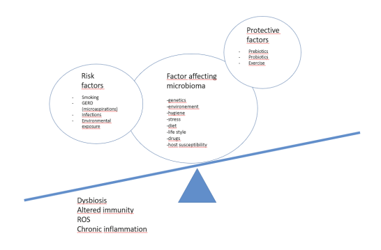
Figure 1. Microbiota imbalance in lung disease. When factors inducing lung dysbiosis have more weight compared to protective factors, can induce disease state. In detail, ROS activation and chronic inflammation could have a crucial role in the pathogenesis of IPF.

Gut dysbiosis can be associated with lung disease or infections (53). This strength correlation between gut and lung could be also responsible for perpetuating inflammatory damage. When intestinal dysbiosis occurs, for example, during infection or antibiotic use, the microbiota-derived signals are altered too, leading to changes in the immune response against pathogens. A similar situation could happen in the lung with a modulation of the microbiota composition, which, in turn, could induce an altered immune response against pathogens. The existence of a gutlung axis could perpetuates this phenomena establishing a vicious circle (54).