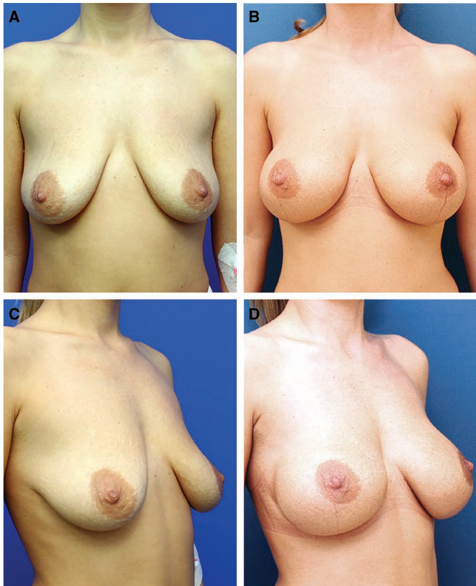
Fig. 2. Clinical case I: front view of a patient before surgery (A) and 2 years after surgery with anatomical Style 510 textured implants (Allergan) of 385 cc and dual-plane technique (B). Clinical case I: lateral view of a patient before surgery (C) and 2 years after surgery with anatomical Style 510 textured implants (Allergan) of 385 cc and dual-plane technique (D).

Ten cases of unsatisfactory breast shape in the outer lateral inferior quadrant emerged about 6 months after the surgery. These cases of pseudo-ptosis were settled with lipofilling sessions.