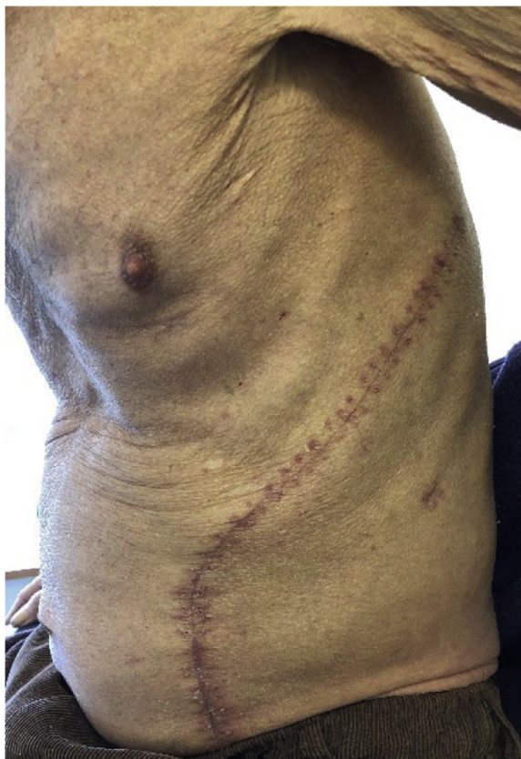
Fig 3. One-month postoperative image in outpatient clinic.

platelets. Endarterectomy of the right common iliac was also performed.