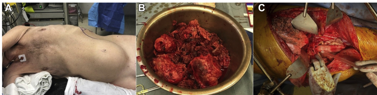
Fig 2. Intraoperative photographs. A , The patient was placed in the right lateral decubitus position. B , A large amount of intramural thrombus was evacuated. C , Final placement of aortic graft before closure of the aneurysmal sac around the graft.

suprarenal clamping. Proximal control was obtained by clamping above the superior mesenteric artery, below the celiac artery. Distal control was obtained at the left common iliac artery, because