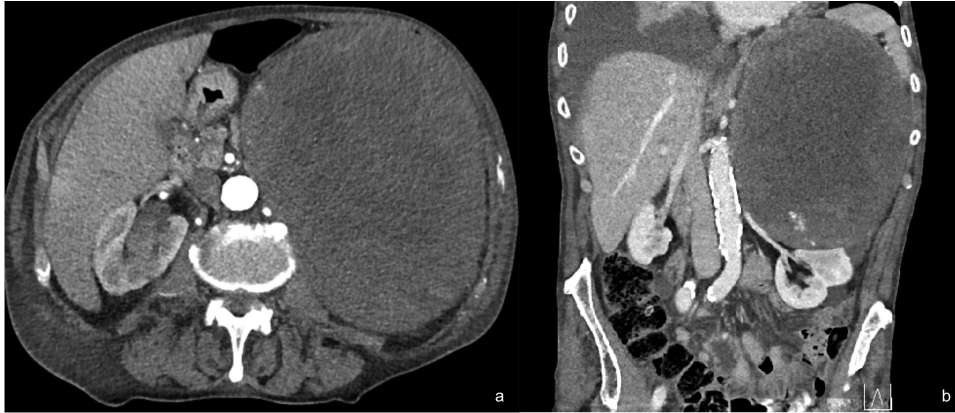
Figure 1: Contrast CT scan of the abdomen of the patient at his admission in the hospital. Axial view showing a left abdominal mass occupying the left upper abdominal quadrant and displacing down the left kidney (a) and renal artery and vein as shown in the coronal view (b).

and the stomach (Fig. 1a and b). No signs of metastatic disease were present.