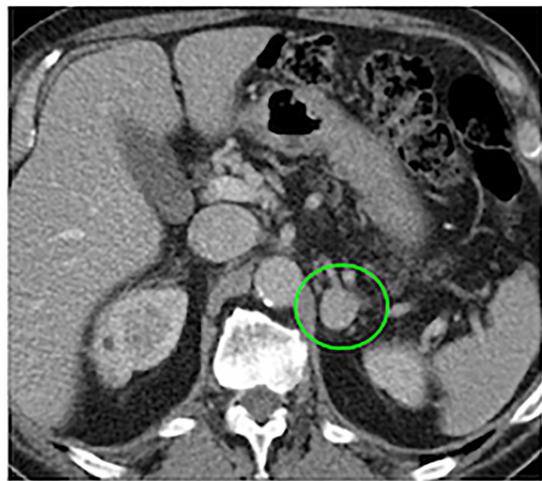
Figure 2: Ten years before abdominal CT scan, provided by the patient, at the time of first diagnosis, showing a 2.3-cm mass at the level of the left adrenal gland (green circle).

Histopathological examination showed sections of adrenal gland with large areas substituted by thrombosed fibro-hemorrhagic material surrounded by a richly vascularized fibrous capsule. The final histological diagnosis was ‘organized and partially revascularized long-term intra-adrenal hematoma’. At light microscopy (Fig. 5), the mass was composed of large hemorrhagic lacunae filled with fluid blood or organized in small or large thrombi (Fig. 5c). The larger thrombotic formations were revascularized with evident proliferating endothelial cells in the new vessels (Fig. 5f). The mass was well contained within the adrenal capsule, which appears collagenized and thicker than usual, often containing residual adrenal tissue (Fig. 5a and b), mostly from the granulosa layer. The problem of differential diagnosis with an angiosarcoma was ruled out by the absence of atypical endothelial nuclei, absence of mitotic figures and the limited necrotic areas. CD31 (Fig. 5d), the vascular cell adhesion and signaling molecule, PECAM-1, in endothelial cells, was strongly positive, demonstrating the