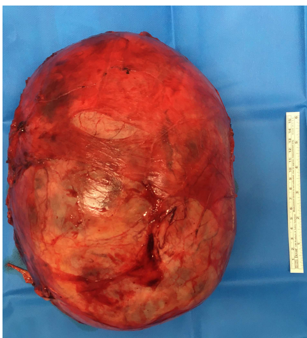
Figure 4: Final image of the mass on the operating table after removal, with its complete capsule.

restored vascular permeability barrier following disruption of the endothelial cell junctions [3], as well as FLI-1 (Fig. 5e), a valuable marker of endothelial differentiation [4].