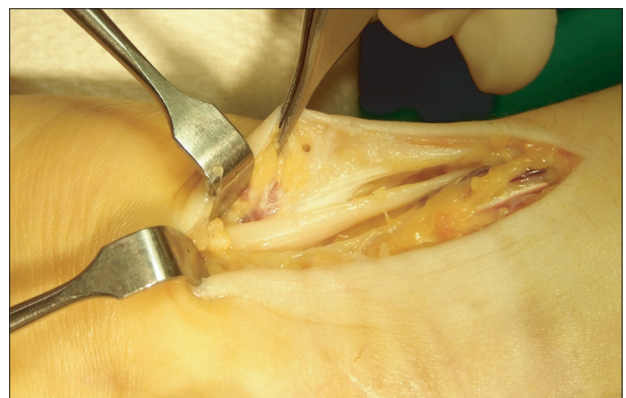
Fig. 4. Photograph shows swelling and compression by the surrounding tissue fibrosis of the ulnar nerve at the level of Guyon's canal.