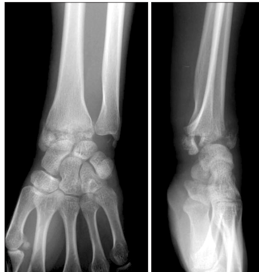
Fig. 3. Anteroposterior and lateral radiographs show a severe intra-articular comminuted fracture of the distal radius with a fracture of the ulnar styloid process.