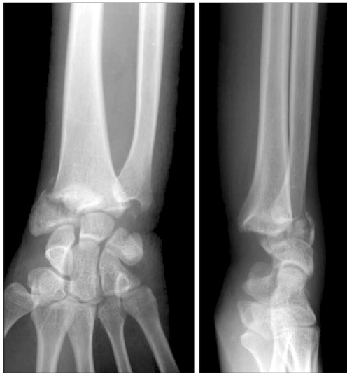
Fig. 1. Anteroposterior and lateral radiographs show an intra-articular fracture of the distal radius with a fracture of the ulnar styloid process. The distal fragment of the radius was displaced dorsoradially.

An open reduction was performed on the day of the trauma. A small 2 cm-incision was made on the volar radial side to expose the fracture site. A reduction of the articular surface was attempted using a periosteal elevator. The bone deficiency in the metaphysis was treated with an allogeneous cancellous bone graft, and an external fixator