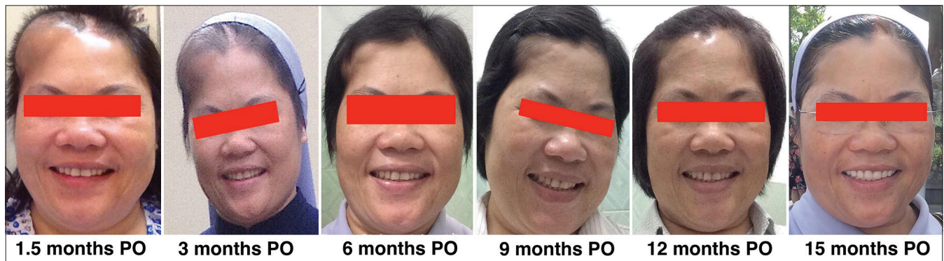
Figure 1: Evolution of postoperative frontal pseudomeningocele (PO: postoperative)

Typically, most pseudomeningoceles persist for days or weeks then promptly disappear within 1 or 2 days, indicating that the abnormal accumulation of CSF is temporary and could be reabsorbed completely. [10] However, infection, radiation, malnutrition, and increased CSF pressure may result in persistent pseudomeningoceles. [1] As there is no consensus in treatment strategy, pseudomeningocele, especially giant one may be managed differently among clinicians. The overall average opinion ascertained from an international survey of Tu et al. suggested that postoperative pseudomeningocele, without hydrocephalus, should be monitored for 7–14 days before re-exploration. [10] In case of hydrocephalus, 48% of neurosurgeons initially intervene with CSF diversion and would change the method if the lesion does not decrease within 2–4 days. [10] This survey concluded that initial follow-up was appropriate for cranial pseudomeningoceles. In case of failure with conservative management including pressure bandages, percutaneous fluid aspiration, bed rest, and CSF lumbar drainage, surgical intervention is recommended. [10,17,18] In case of postoperative ventriculomegaly, CSF shunting may be required if lumbar drainage has been failed. [7] For example, a report at British Columbia’s Children’s Hospital in Vancouver, Canada showed 73.5% of cranial pseudomeningoceles after posterior fossa surgery were