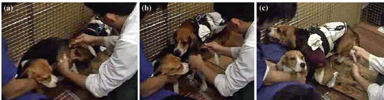
Fig. 1 Copulatory behavior by the hand method in the male dog. a Exposing female dog to male dog and sniffing; b Mounting; c Ejaculation by the hand method

Blood samples (2 ml) were collected into tubes containing heparin sodium (VENOJECT; Terumo, Tokyo, Japan) via the right cephalic vein with an indwelling needle and catheter at the following 10 time points: rest; exposure of the female dog to the male dog; mounting; first ejaculation fraction; second ejaculation fraction; third ejaculation fraction; and 5, 10, 30 and 60 min after the first fraction. All blood samples were kept on ice until centrifugation at 2,200\times g for 15 min at 4 °C, and plasma fractions were stored at –80 °C until analysis. Plasma NA and Ad concentrations were measured by high-performance liquid chromatography (C-R7A; Shimadzu, Tokyo, Japan) using a system equipped with an electrochemical detector