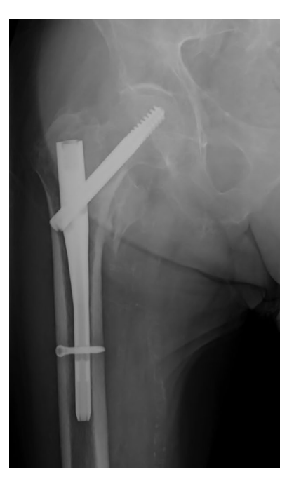
Fig. 5 Radiographic image of a nail/femoral canal mismatch. This nail has been distally locked.

1. Peri-implant fractures: It has been suggested that distal screws act as stress risers, predisposing patients to fractures around the screw.<sup>35,36,46</sup> This notion has been recently challenged in two articles. Skála-Rosenbaum et al conducted an 849-patient prospective study which reported an 85.7% higher risk of peri-implant fracture after unlocked distal nailing of AO 31A1 and A2 fractures relative to locked nailing in dynamic mode. The authors described two fracture patterns related to the distal locking technique, all of which occurred as a lowenergy trauma after a fall. Type I fractures occur in the proximal part of the femur, above the tip of the nail during the first postoperative weeks, before fracture healing has occurred. The authors suggest that the cause of instability is a large dorsomedial fragment whose size or comminution may not have been fully appreciated through radiography or secondary fracture lines that occurred during nail insertion. Type II fractures occur at the tip of the nail after bone consolidation has taken place. In 4/6 cases, the nails did not fill the intramedullary cavity completely (Fig. 5). It has been proposed that micromovements at the tip of the unlocked nail weaken the femoral shaft cortex, which predisposes patients to peri-implant fracture.47 Lindvall et al reported similar findings in a study with 171 patients treated using short nails. They reported eight refractures (9.0% at five years), seven of which