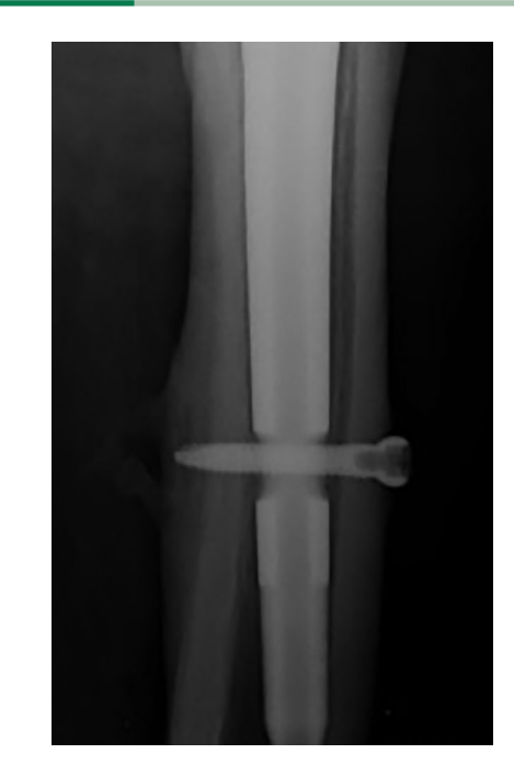
Fig. 4 Radiographic image of distal cortical hypertrophy around the distal medial nail tip.

Recent reports suggest that stable trochanteric fractures can be treated using distally unlocked nails with good clinical results, as shown in Table 2.<sup>10,33–37</sup> The first