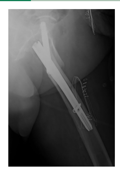
Fig. 6 Radiographic image of anterior cortical notching of the nail tip.

1. Peri-implant fractures: It has been suggested that distal screws act as stress risers, predisposing patients to fractures around the screw.<sup>35,36,46</sup> This notion has been recently challenged in two articles. Skála-Rosenbaum et al conducted an 849-patient prospective study which reported an 85.7% higher risk of peri-implant fracture after unlocked distal nailing of AO 31A1 and A2 fractures relative to locked nailing in dynamic mode. The authors described two fracture patterns related to the distal locking technique, all of which occurred as a lowenergy trauma after a fall. Type I fractures occur in the proximal part of the femur, above the tip of the nail during the first postoperative weeks, before fracture healing has occurred. The authors suggest that the cause of instability is a large dorsomedial fragment whose size or comminution may not have been fully appreciated through radiography or secondary fracture lines that occurred during nail insertion. Type II fractures occur at the tip of the nail after bone consolidation has taken place. In 4/6 cases, the nails did not fill the intramedullary cavity completely (Fig. 5). It has been proposed that micromovements at the tip of the unlocked nail weaken the femoral shaft cortex, which predisposes patients to peri-implant fracture.47 Lindvall et al reported similar findings in a study with 171 patients treated using short nails. They reported eight refractures (9.0% at five years), seven of which