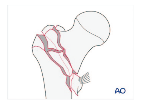
Fig. 2 Arbeitsgemeinschaft für Osteosynthesefragen/Orthopaedic Trauma Association (AO/OTA) 31A2 pertrochanteric fracture illustration.