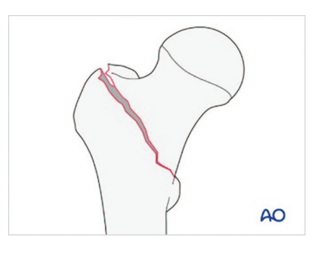
Fig. 1 Arbeitsgemeinschaft für Osteosynthesefragen/Orthopaedic Trauma Association (AO/OTA) 31A1 pertrochanteric fracture illustration.