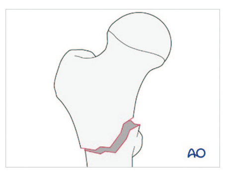
Fig. 3 Arbeitsgemeinschaft für Osteosynthesefragen/ Orthopaedic Trauma Association (AO/OTA) 31A3 intertrochanteric fracture illustration.