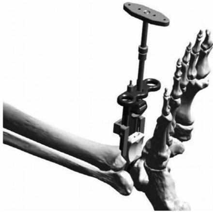
Figure 3: Inserter assembly.

poly component design. He found one case of complication due to dislocation of poly component. Hoffman and Fink after a systematic search of literature since 2000 evaluated 26 papers with a total of 1318 follow-up ankle prosthesis [5]. Of 1318, a total of 188 were surgically revised, out of which seven were due to dislocation of inlay i.e. 0.53%.