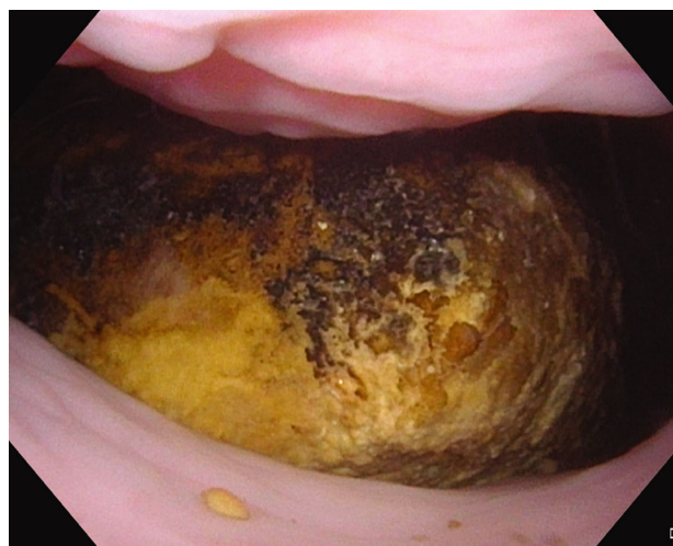
Fig. 2 The cystoscope was inserted into the vagina and a huge yellowish-brown calculus was present. The calculus was not adherent to the vaginal mucosa. There was no fistula with the bladder in the vagina.

A secondary mechanism for our patient's vaginal calculus was her cerebral palsy with long-term urinary incontinence;