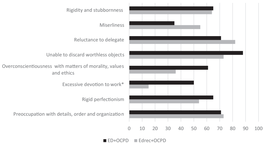
FIGURE 2 The percent of patients scoring above cut-off for each OCPD symptom included in the Diagnostic criteria for OCPD according to DSM-IV. No difference was seen between the group still clinically exhausted (ED+OCPD) compared with those who have recovered (EDrec+OCPD) except for the symptom “excessive devotion to work” reported by significantly more patients that are still exhausted

Abbreviations: ED, exhaustion disorder (i.e., still fulfilling criteria for ED at the follow-up 7–12 after ED baseline diagnosis; EDrec, clinically recovered from exhaustion disorder (i.e., no longer fulfilling criteria for ED at the follow-up); OCPD, obsessive–compulsive personality disorder, HADS, Hospital and anxiety depression scale, SD, standard deviation.