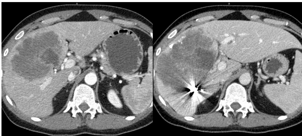
Fig. 3. Left lateral segment hypertrophy. The image at left shows the liver before portal vein embolization (PVE), with a small left lateral segment (1067.391 cm 3 ). The figure at right demonstrates scatter from embolization of the right portal vein, as well as significant hypertrophy of the left lateral segment (1801.602 cm 3 ).

The liver specimen demonstrated a smooth mottled capsule with a 13 cm × 7 cm rough white-gray nodular area exhibiting overlying fibrous adhesions. A well-circumscribed yellow-gray mass measuring 14 cm × 12.5 cm × 10.5 cm and a cyst, central within the mass measuring 5.5 cm × 5 cm × 4.5 cm, were revealed