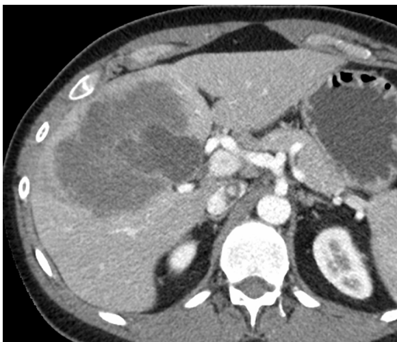
Fig. 1. Incidental finding of hypoenhancing hepatic lesion noted on CT conducted in response to elevated ESR and CRP.

Herein, this report identifies a fifth case of primary SCC of the liver arising from a CHFC. This case is unique in that the liver lesion was asymptomatic and was found incidentally on computed tomography (CT). In addition, successful management with sequential transcatheter arterial chemoembolization (TACE) and portal vein embolization (PVE) allowed for a therapeutic surgical intervention.