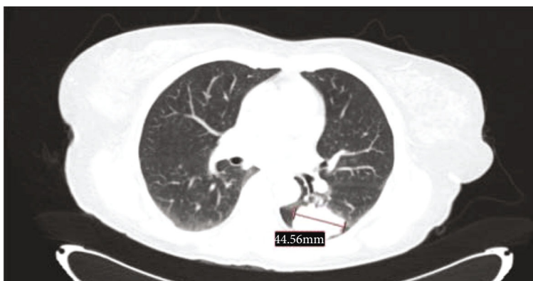
FIGURE 2: Lung mass on thoracic CT scan at diagnosis.

such as intracranial hypertension and severe neurocognitive decline.