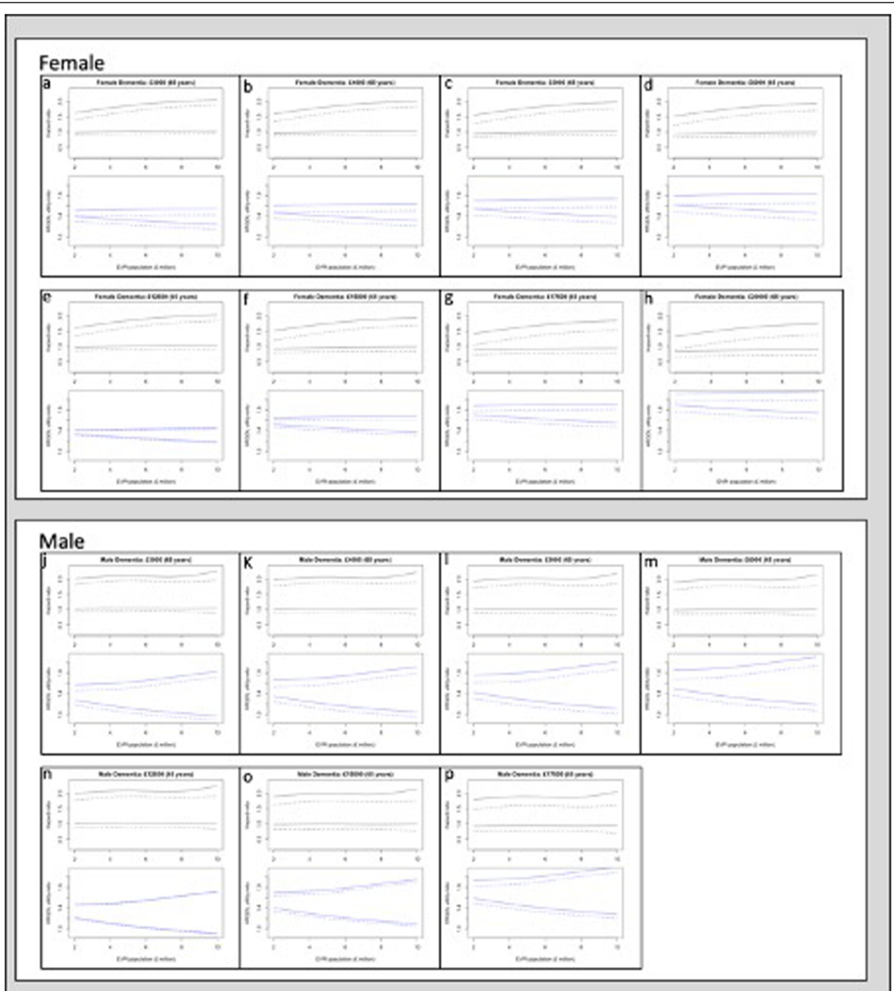
Fig. 3 Uncertainty analysis: 95% confidence interval of HRQOL utility-ratio, 95% confidence interval of SHF hazard ratio as a function of the expected value of information at population level (£ million). Abbreviations: Health Related Quality of Life (HRQOL); Expected Value of Perfect Information (EVPI). Legend: dashed lines (HRQOL utility-ratio threshold); solid lines (hazard ratio threshold)

around HR. The cost of the exoskeleton in the purchase scenarios has a prominent influence on the HR 95% CI. For example, assuming that the population EVPI is £2.5 million, the 95% CI of the HR of falling ranges from 0.68 to 0.95 and it is paired with a utility-ratio ranging from 1.76 to 1.96 (Fig. 3; panel h,