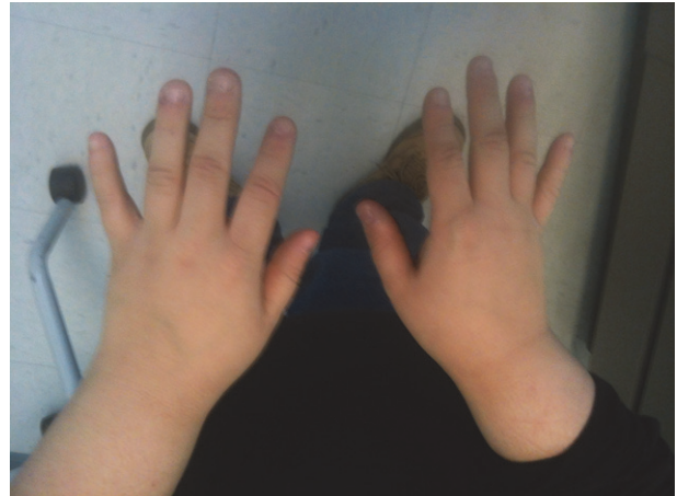
FIGURE 2: Small hands characteristic of Prader-Willi syndrome.

We decreased his hydrocortisone dosage to 20 mg twice a day (equivalent 25 \text{ mg/m}^2/\text{day} ) with the goal of 17-hydroxyprogesterone level between 100 and 1000 ng/dL and androstenedione level normal for age and sex. His electrolytes were \text{Na}^+ 135 mEq/L, \text{Cl}^- 100 mEq/L, \text{CO}_2 27 mEq/L, and \text{K}^+ 4.3 mEq/L. Hologic DEXA scan showed bone mass density below expected range for age. Femoral neck Z-score was -3.2 , total hip Z-score was -3.3 , and total body Z-score was -1.7 ( -1.0 to -2.5 SDS).