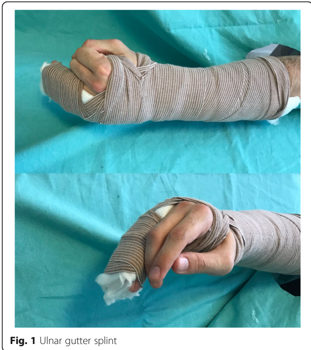
Fig. 1 Ulnar gutter splint

All patients were asked to attend the following follow-up visits: 1 week, 1 month, 2 months and 6 months after injury. Anteroposterior (AP) and 30° oblique X-rays were obtained following fracture reduction with a splint and at the first and sixth months without the splint. Angulation was measured on 30° oblique views by setting the upper cortex as a reference point [16] (Fig. 3a). Shortening was measured on AP view using the Shortening Stipulated (SH-Stip) technique [16]