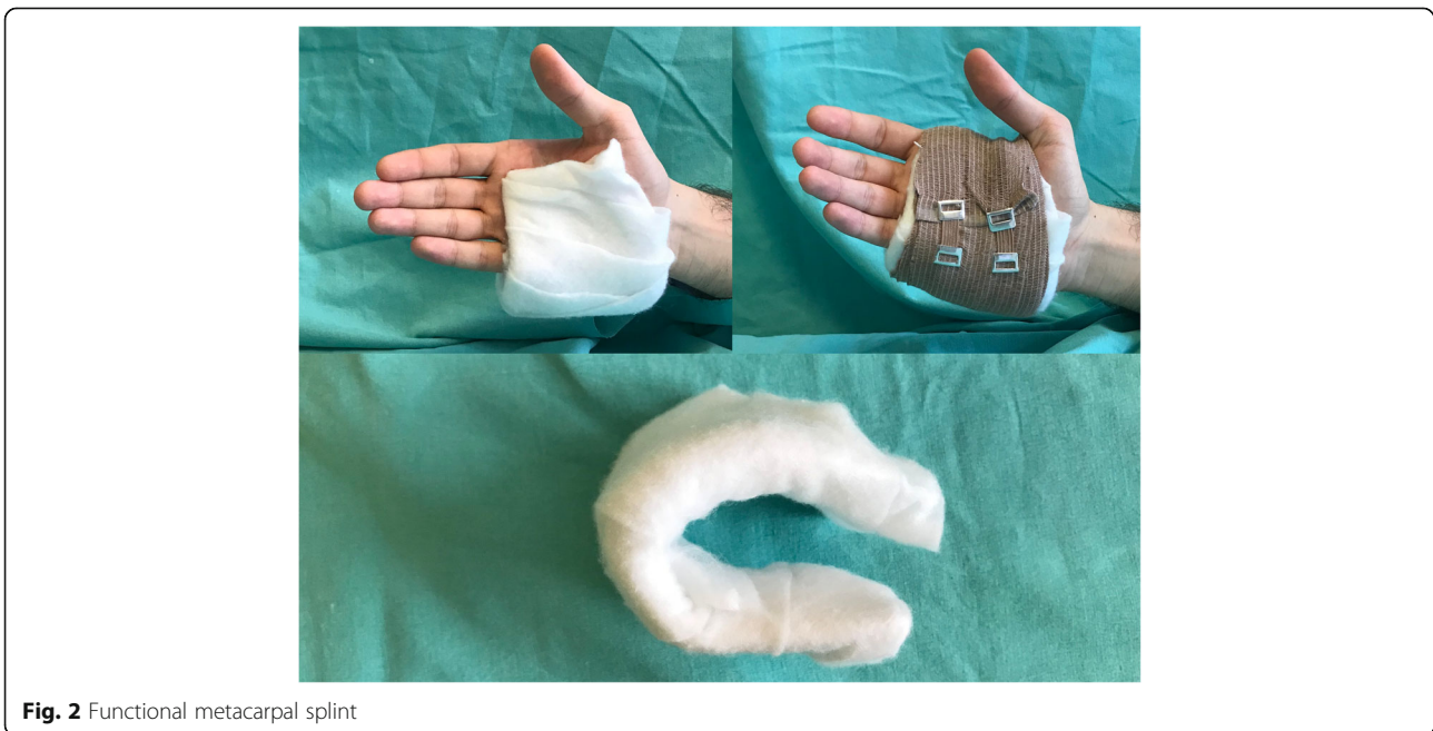
Fig. 2 Functional metacarpal splint

Functional outcomes were measured with the shorter version of Disabilities of the Arm, Shoulder, and Hand (QuickDASH) Questionnaire [17, 18]. The validated Turkish version of the QuickDASH questionnaire was used [19]. Grip strength was tested by Jamar Plus+ hand dynamometer (Patterson Medical, Illinois, USA). It is a device providing accurate results, used and recommended by previous studies [20, 21]. Test was applied to both hands in neutral position to minimize the effect of other factors. Both hands were tested thrice at each evaluation, and the mean value of three results was calculated. Loss of grip strength was also determined by measuring the difference in mean strength value between the involved and noninvolved extremities. The evaluation was made on the basis of the assumption that the average hand grip strength for the dominant hand is 10% greater than the nondominant hand, and expected grip strengths of the hands were calculated accordingly [22]. QuickDASH and grip strength tests were applied at the first month after splint removal (second month evaluation) and sixth months after trauma. All radiological and clinical evaluations were