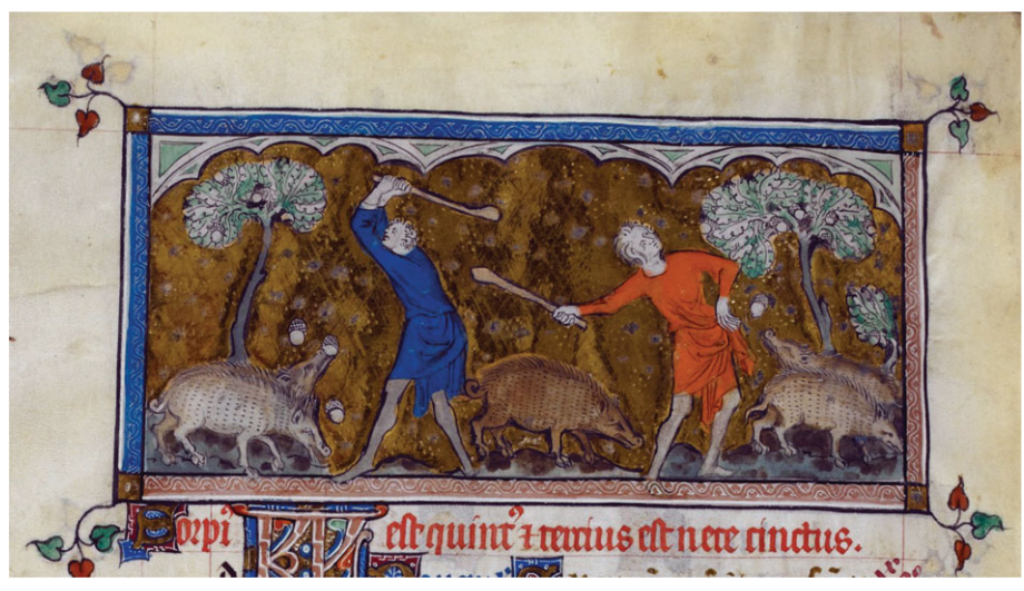
Figure 1. Men knocking down acorns to feed swine. From the Queen Mary Psalter , made in England between 1310 and 1320.