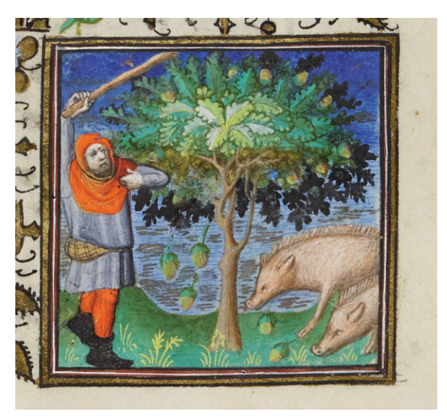
Figure 2. Another illustration of a man knocking down acorns to feed swine. From a Book of Hours , made in France in the early 15th century. Beating of oaks to knock down acorns was commonly used to illustrate the 'Labour of the Month' for November, when pigs were fattened prior to slaughter in December.

By contrast, the history of 'masting' (along with the more descriptive 'masting behaviour', 'mast fruiting' and 'mast seeding') as referring to the variable and synchronized production of seeds by a population of plants [14], rather than putting swine out to feed on acorns, is relatively recent. This is despite it having been long obvious to both foresters and farmers that seed crops of beech, oak and various other species varied considerably from year to year. One of the first of the former to consider the causes of masting was Georg Ludwig Hartig (1764-1837), a renowned German forester whose career included being Chief Inspector of Forests in Stuttgart and Berlin and culminated with an Honourary Professorship at the University of Berlin in 1830. Hartig suggested that periodic fruiting by European beech (Fagus sylvatica) was related to the period of time required by trees to build up reserves depleted during a large mast year [15], foreshadowing the resource threshold model that has shaped thinking about masting over the past 20 years.