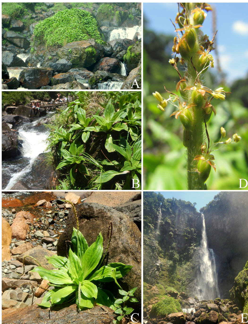
Figure 4 Photographs of Plantago humboldtiana . (A) The only known population of Plantago humboldtiana . (B) Detail of the environment. (C) Isolated individual clearly displaying the pendulous inflorescences, one of the key characters of this species. (D) Detail of inflorescence. (E) Overview of Salto Grande waterfall, in Corupá municipality, Santa Catarina state.