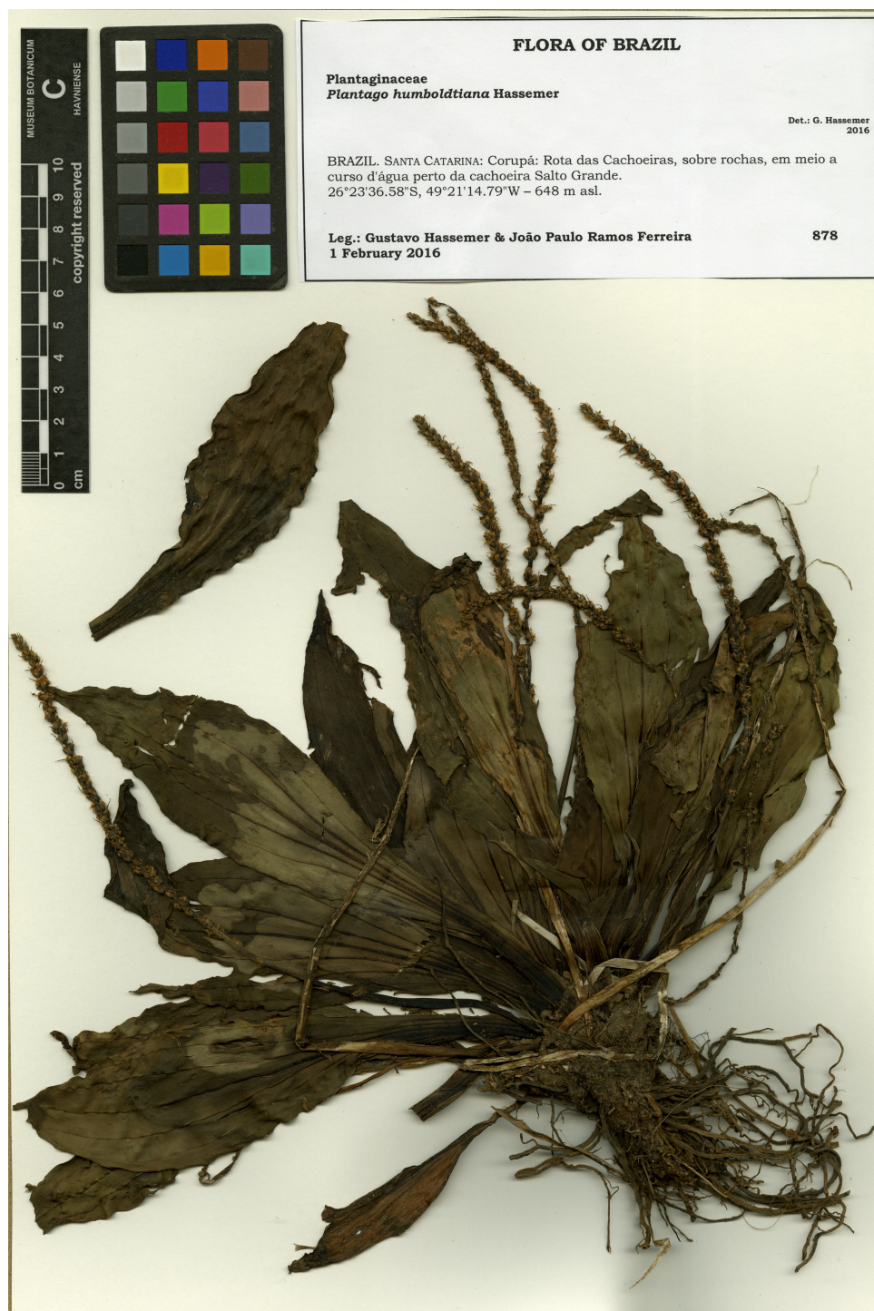
Figure 3 Scanned image of the holotype of Plantago humboldtiana (G. Hassemer & J.P.R. Ferreira 878 (FURB)).