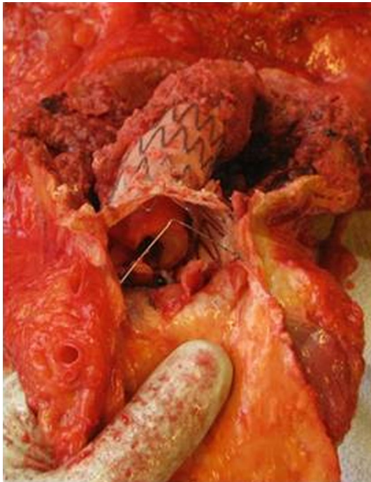
Fig. 3 Cranial view, during autopsy, of the abdominal aorta with the endovascular aneurysm repair (EVAR) stent-graft. The lumen of the celiac trunk and superior mesenteric artery are visible. Around the EVAR the aneurysmatic plaque inside the dilated vascular wall is still in situ, the material was PCR positive for C. burnetii . A fistula from the abdominal aortic aneurysm (AAA) to the psoas abscess was present (not visible on picture). Inside the EVAR an intra-prosthetic deposition of amorphous material is visible

patient already reported general malaise for years, chronic chest pain and left flank pain ever since the EVAR procedure. Furthermore, he already had an elevated CRP whilst consulting the cardiologist, pulmonologist and rheumatologist in the years before presentation, who related this to his active RA and intercurrent problems. Our patient lived in an area in the Netherlands with the highest incidence of Q fever during the large Q fever outbreak from 2007 to 2010 [15, 16], and inhalation of contaminated aerosols was probably the route of initial infection [17]. In Q fever endemic areas or in the years after outbreaks, physicians should stay alert on signs and symptoms suggestive for chronic Q fever, especially in case of risk factors, also in the absence of a known acute Q fever episode. Well-known risk factors for developing chronic Q fever include vascular grafts and aneurysms, cardiac valve prosthesis or valvulopathy, and immunosuppression [18]. Despite the fact that EVAR specimens appeared to be PCR positive for C. burnetii , the EVAR could not be revised in this case. The main reason for the decision to abstain from surgical intervention was the already expanded infection, and the patients' deteriorating physical condition. However, in case of a chronic Q fever infection of a vascular prosthesis, surgical interventions can