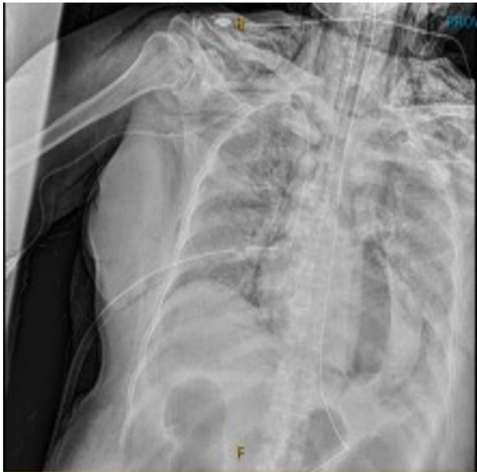
FIGURE 3: Chest X-ray after first chest tube.

Chest X-ray showing persistent right pneumothorax despite initial chest tube placement requiring second chest tube.