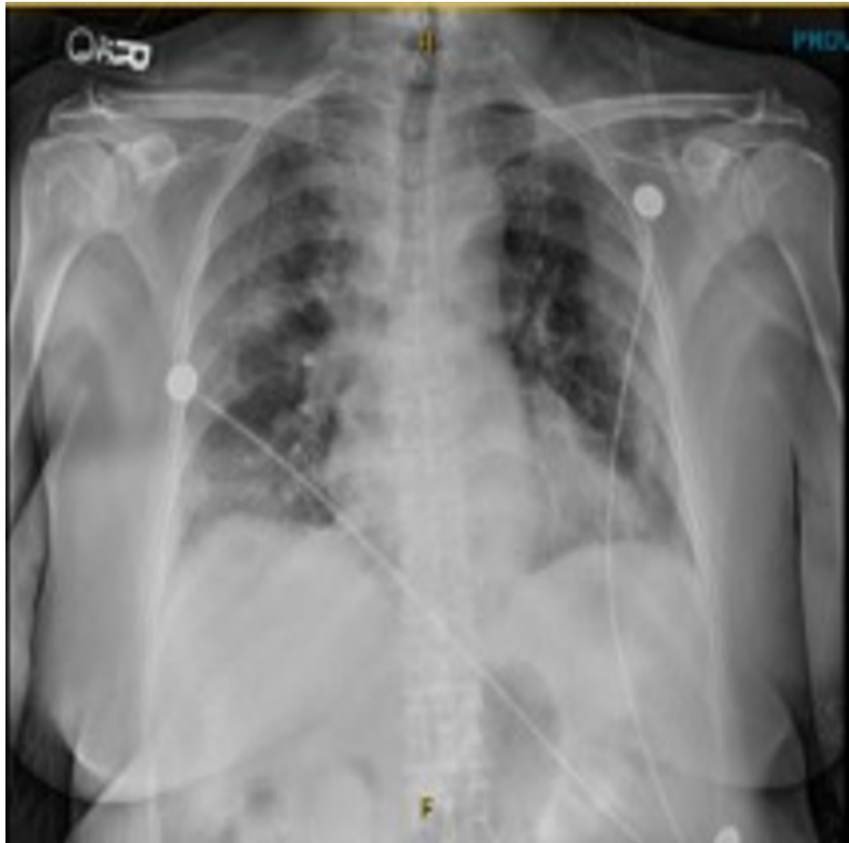
FIGURE 1: Chest X-ray on admission.

Chest X-ray on admission showing bilateral ground-glass opacities consistent with COVID-19 infection.