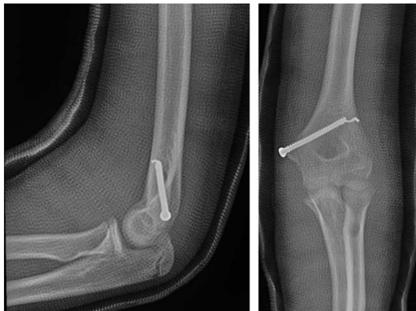
FIGURE 1. Postoperative anteroposterior and lateral radiographs of the elbow obtained in a cast demonstrating a partial, distal thread delamination after open reduction and internal fixation of a medial humeral epicondyle fracture.

This small series reports 6 cases of thread delamination in a pediatric population associated with 4.5 mm AO cannulated stainless-steel screws, most commonly in the setting of fixation of medial humeral epicondyle fractures. It is important to note that each case that occurred at our institution generated an occurrence report internally, which according to standard procedure was subsequently entered into a reporting system to the United States Food and Drug Administration. Each case was also submitted for consideration for presentation at our department's morbidity and mortality conference. While previous case reports and a small case series