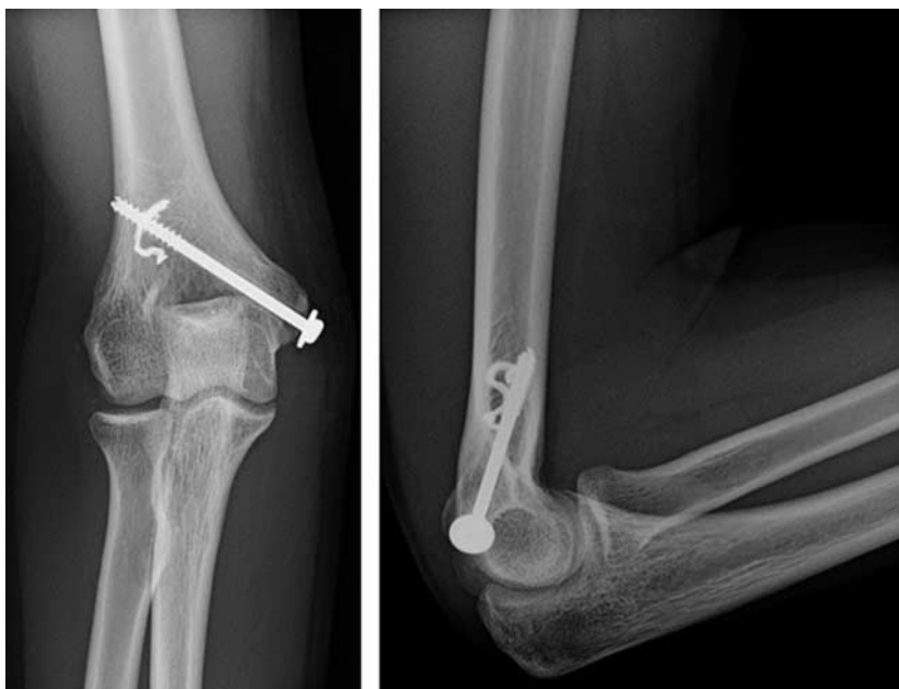
FIGURE 3. One-year postoperative anteroposterior and lateral radiographs of the elbow after open reduction and internal fixation of a medial humeral epicondyle fracture demonstrate that the retained thread from the index procedure remains in situ.

include a cannulated tap for use in subjectively denser bone, it is important to emphasize that predrilling and pretapping are unnecessary in the majority of cases as the implants themselves contain self-drilling and self-tapping flutes. 11 This is consistent with the technique utilized in the current study in that none of the cases were predrilled or pretapped over the length of the screw. While it is plausible to suggest that predrilling and pretapping along the