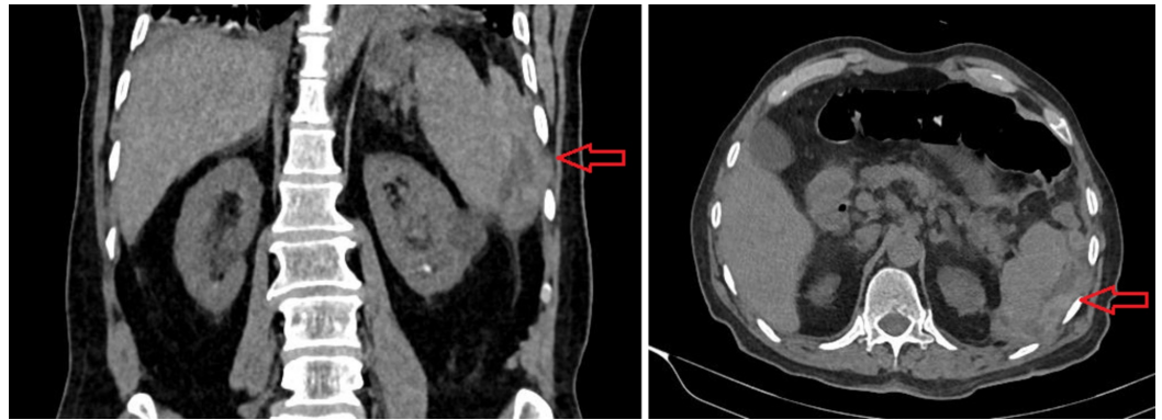
FIGURE 3: Coronal (left) and axial (right) view of the loculated collection of approximately 111x54 mm in the perisplenic area