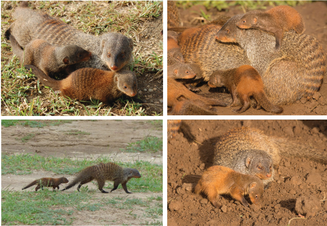
Figure 1. Escorts care for the pups carrying, feeding and grooming them.

data and set of predictor variables included in each analysis, see details below and electronic supplementary material, tables S1–S3.