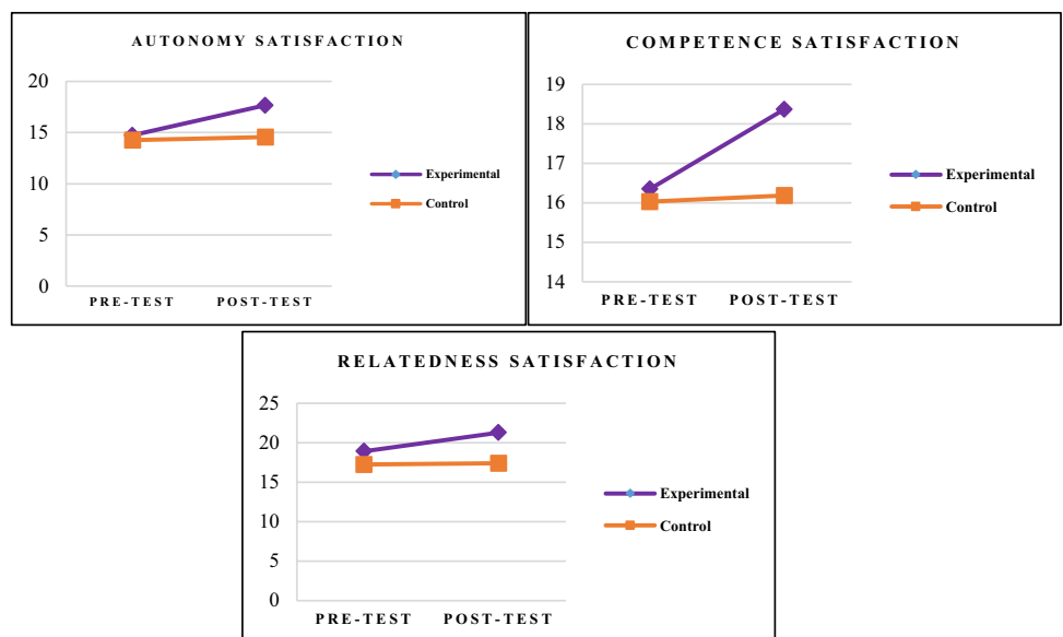
Fig. 2 Employees' autonomy need satisfaction (left panel), competence need satisfaction (right panel), and relatedness need satisfaction (below panel) broken down by experimental condition and time of assessment

competence (indirect effect = 0.18, CI = 0.02 to 0.34), and relatedness (indirect effect = 0.14, CI = 0.01 to 0.28). Also, there were negative indirect effects of the intervention on amotivation through autonomy (indirect effect = -0.18, CI = -0.31 to -0.06), competence (indirect effect = -0.15, CI = -0.29 to -0.01), and relatedness (indirect effect = -0.13, CI = -0.25 to -0.01).