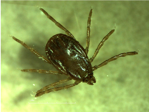
FIGURE 1 Dorsal view of female Rhipicephalus sanguineus (brown dog tick) collected from domestic dogs in Kwara State, Nigeria

CI = confidence interval; Df = degree of freedom.