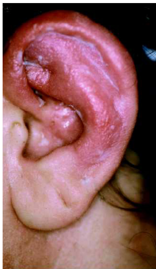
Figure 5: Allergic reaction with incipient blister-forming dermatosis

Allergic reactions on the skin of the auricle can occur as allergies to washing agents. However they are caused considerably more frequently by ointment bandages (iodine allergy for example). Auricle pressure bandages with antibiotic ointment are frequently used for post-operative treatment. In individual cases we could observe the most serious swellings and blister-forming dermatoses as a consequence of allergic reactions [55] (Figure 5).