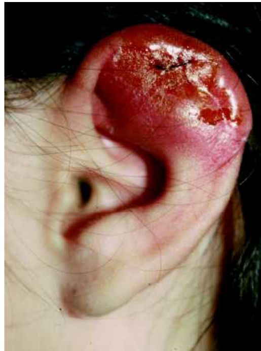
Figure 3: Wound infection. Incipient perichondritis

Wound infections can be caused by insufficient preoperative hygiene (head and hair washing). This complication requires the use of broadband antibiotics (e.g. 2 nd or 3 rd generation cephalosporin [55]) and analogous local treatment of the auricle. Stitches that are too tight should be removed. If necessary the wound edges should be spread in order to prevent overlapping of the swelling on the auricle (perichondritis) that can lead to deformities of the auricle. This would then be a surgical emergency where prompt debridement of necrotic tissue is necessary [59], [101]. Incipient perichondritis also responds well to appropriate antibiotics and local measures. Pseudomonas aeruginosa or staphylococcus aureus are the most common causes. A swab is obligatory [120] (Figure 3). A complete overview of literature showed an infection in 3.6% of cases (22 out of 593 ears) [124].