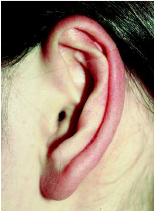
Figure 15: State following otopexia with extensive removal of ear cartilage