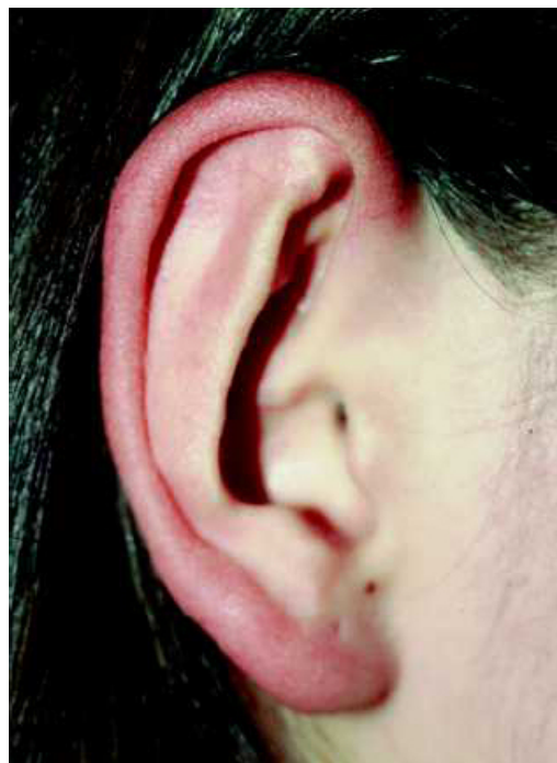
Figure 10: Excessive edge formation on the right auricle

take. Sharp edges can also occur because of separation of the ventral perichondrium or incisions in the incorrect place [75]. The corrective operation can be done by careful abrasion of the cartilage in the anthelix area or by equalisation using a scalpel. According to the extent and the severity of edge formation, fascia temporalis can be used to smooth out the edges following undermining of the anterior skin, depending on the shape of the anthelix or crura. However, if the skin of the auricle is extremely thin and the formation of edges is pronounced, recreation of a soft and smooth auricle edge is hardly possible [116], [119], [121], [122] (Figure 10).