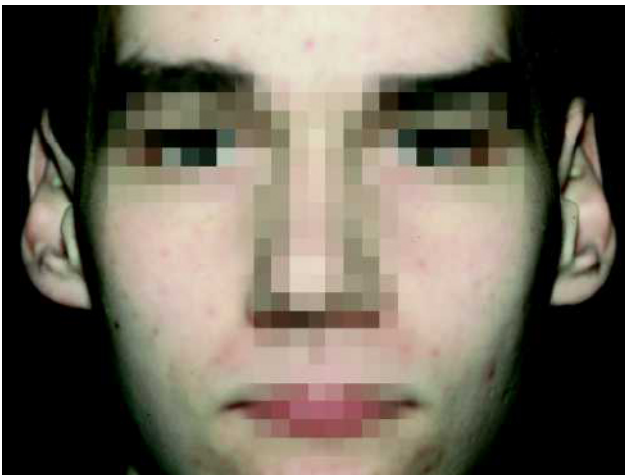
Figure 16: Over-correction in the cranial part of the auricle, under-correction in the caudal auricle. This leads to the formation of what is called a 'spock ear'.