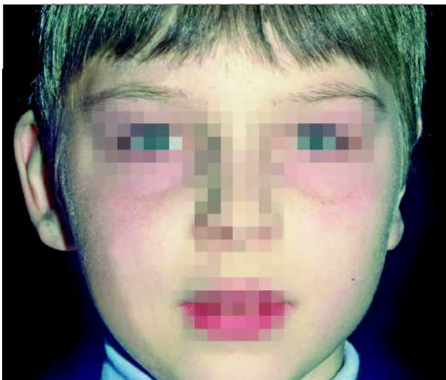
Figure 11: State following over-correction of the left auricle with excessively closeness. The impression of 'emptiness' of the left half of the face is apparent.

Patients with auricles that are too close-fitting also frequently complain about pain, especially when lying down. It is possible to correct these complications using targeted lobe correction [12], [64], [87]. We have achieved considerably better results using free full-thickness skin transplants. However, care should be taken to ensure that the transplants taken are not too small, because, on the one hand, the defect to be covered is surprisingly extensive after unpicking the scar and separation of the auricle from the mastoid. On the other hand full-thickness skin transplants tend to shrink so that complications could occur again as a result. We take the grafts required from the groin region [89], [128], [131].