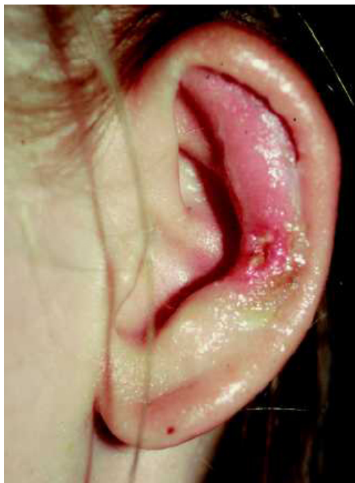
Figure 6: Pressure ulcer in typical position with incipient perichondritic irritation

after the operation and not practise any team sports or other sports that could result in the stitches being ripped out.