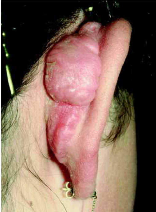
Figure 12: Massive retroauricular keloid

thickness skin transplants (Figure 12, Figure 13). There was recurrence in one case where a keloid occurred at the removal point - the groin region. The frequency of keloids is given in the statistics collected by Weerda with 1.8% (14 of 775) [124].