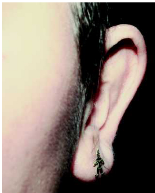
Figure 9: Telephone ear

'Telephone ear' is characterised by the protrusion of the upper helix edge and of the earlobe. It is a consequence of the overcorrection of the middle part of the auricle. Over-proportional resection of retroauricular skin makes telephone ear more likely to occur. It can be avoided if a dumbbell-shaped skin excision is used instead of elyptoid skin excision. The auricle should be evaluated from the front aspect in order to make any early corrections, while the patient is still on the operating table. Late corrections of telephone ear require an extended mobilization of the auricle, whereby the skin deficits have to be replaced with sealing flaps or a full-thickness skin transplant [16], [57], [115], [123] (Figure 9).