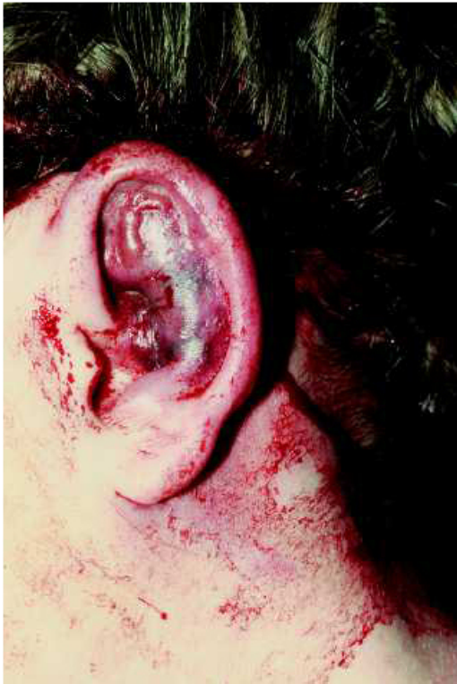
Figure 1: Acute othaematoma on first post-operative day