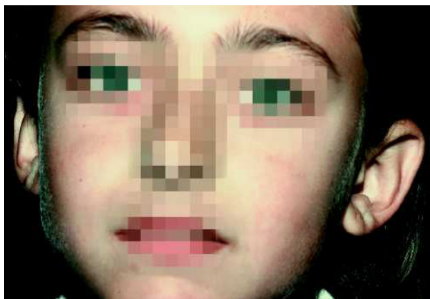
Figure 8: Post-operative state following bilateral otopexia. Recurring apostasy of the left auricle

Recurrences are directly dependent on the operation technique used, but they cannot be reliably ruled out with any one corrective method. It is not to be expected that the frequency of recurrence is higher with pure stitching techniques than with incision/stitching techniques. However this contradicts the number of collected statistics published by Weerda where 7.7% of recurrences (164 of 2,136 ears) were seen following the mustard technique. On the other hand the frequency of recurrences following the converse technique is 10.5% (85 of 812 ears). Recurrences are most seldom observed following incision techniques. If an auricle that has been operated on according to these methods protrudes even further, this concerns an intra-operative under-correction [46], [125], [127] (Figure 8).