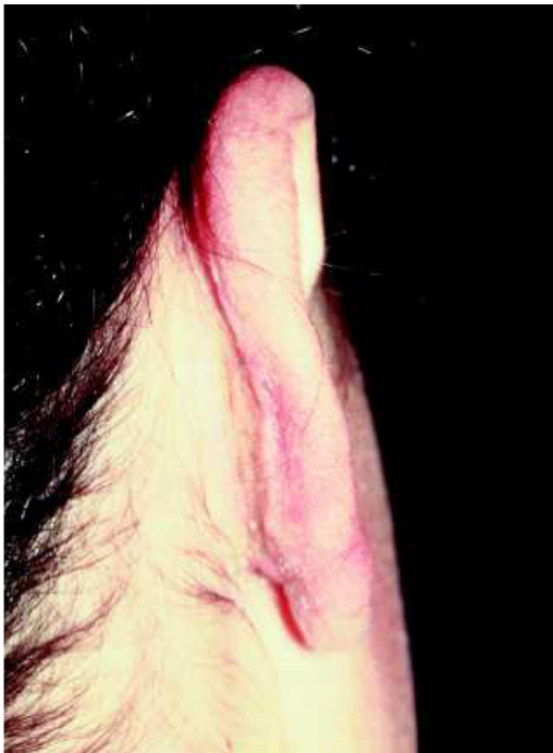
Figure 13: State following keloid removal and covering of defect with free full-thickness skin transplant from the groin region (18 months postoperative)