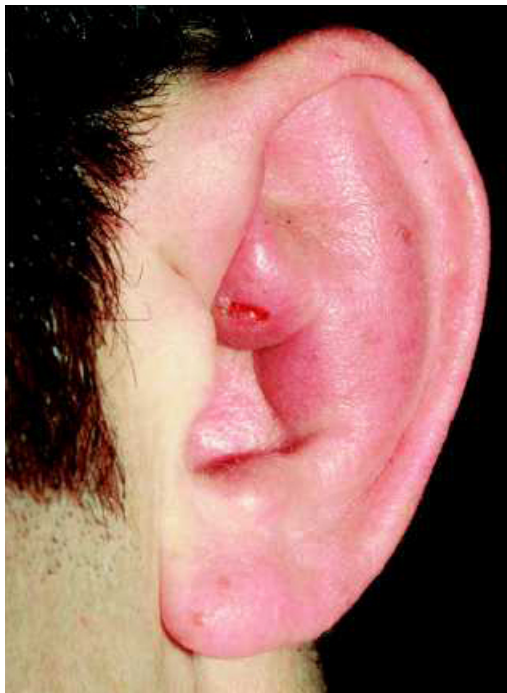
Figure 4: Abscess forming on the stitch granuloma just before the perforation

could result in stitch perforation [66]. In any case, in the presence of fistulae and granulomae, the stitching material used should be carefully completely removed. The same is also valid for ligatures or scars on the surface, whose edges can be seen through the skin of the auricle. After removal of 1-2 stitches there is usually no change in the cosmetic result. Fistulae caused by stitches are found in 9.9% of cases (53 out of 533 ears) [116], [118], [124] (Figure 4).