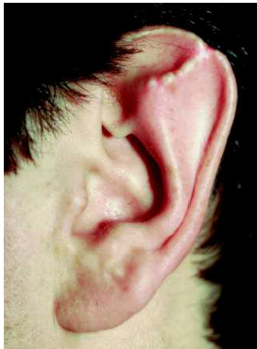
Figure 18: An unsuitable operatin procedure, namely wedge excision was carried out here to correct an apostasies.