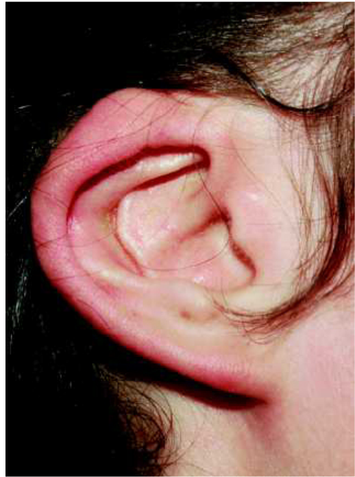
Figure 17: State following separation of the ear cartilage. The entire cavum cartilage was attached to the mastoid for cavum rotation.