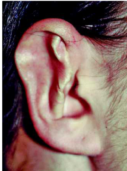
Figure 14: Collapsed ear following otopexia with complete destruction of the ear cartilage structure. Side view

Collapsed ear concerns disorders that occur when all of the complications described above come together, along with the use of wholly inappropriate operation techniques, without consideration of the anatomy of the auricle [104]. We have been able to observe auricles where there were massive, coarse, induced thickenings caused by a haematoma with loss of relief of the auricle or excessive formation of edges. There are also ears where nearly the entire cartilage has clearly been removed and the remaining skin has been attached to the mastoid. (Figure 14, Figure 15, Figure 16, Figure 17, Figure 18). Such excessive deformities are usually the consequence of inadequate operation techniques that contradict all of the principles of plastic and reconstructive surgery. It is assumed that these types of disorders, whose causes are usually iatrogenous, have medical and legal consequences. It is therefore essential that exact and comprehensive pre-operative explanations are made, together with corresponding documentation.