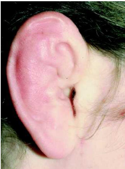
Figure 2: Chronically indurated scar-like, thickened old othaematoma ('ring ear')