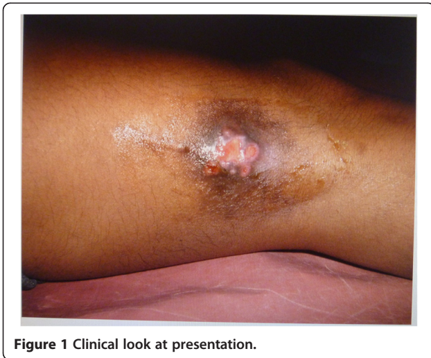
Figure 1 Clinical look at presentation.

of weight, cough, or chest pain. After 9 months from the day of injury, he visited our hospital.