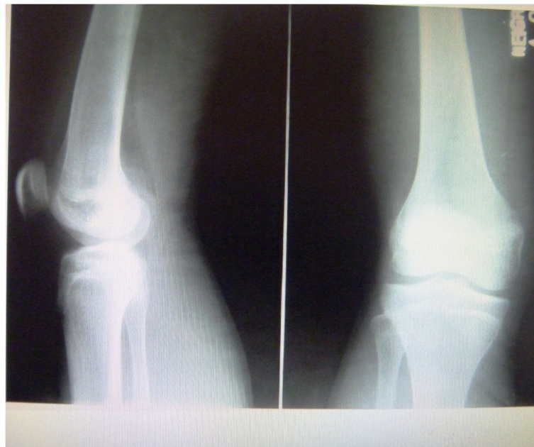
Figure 2 Radiograph not showing any bony lesion or sequestrum or foreign bodies.

In various cadaveric studies [2], a sensitivity of 94% and a specificity of 99% have been demonstrated for sonography as a diagnostic modality in fresh cases. Theoretically, a combination of ultrasound and X-ray films should allow for diagnosis and localization of virtually all foreign