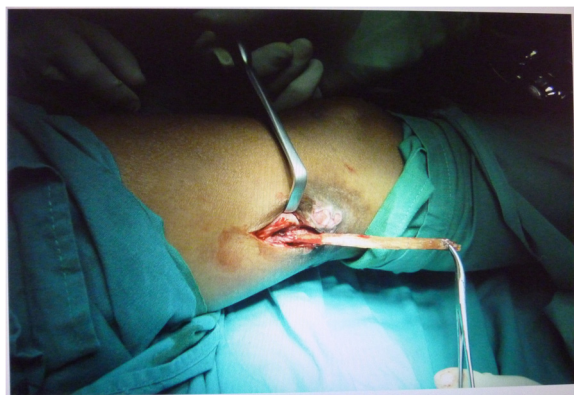
Figure 4 Intraoperative photograph of the removal of the wooden foreign body.

Given the markedly different acoustic impedance of wood and soft tissues, retained wooden foreign bodies are easily identified by radiologists, with the leading edge of the echogenic wood resulting in marked acoustic shadowing [10]. Retained foreign bodies in the soft tissue of the extremities that were initially overlooked and discovered later are unfortunately common [11]. Localization of embedded foreign body may prove to be very difficult. Exploration under regional or general anesthesia with