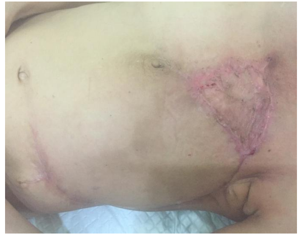
Figure 7: The scar slowly disappeared after two months of operation

has the change to be SCC after mastectomy. This is a primary cause of SCC of the breast.