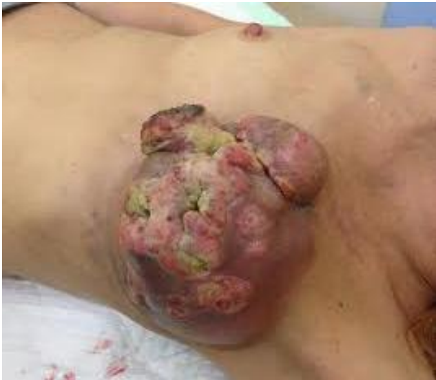
Figure 1: Lump with an ulcer on the left breast

or treated. On 2014, lump getting bigger and patient lost 7 kg during a month. She was hospitalised in Moscow for follow up examination. CT scan showed a mass in the left breast, lymph node enlargement on the left axilla, and pleural effusion on the left lung. The core biopsy revealed as low-differentiated breast cancer, luminal type-B. MRI brain showed no metastasis.