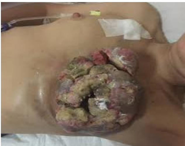
Figure 2: Lump with no response after 6 cycles of chemotherapy

Patients had history 4 cycles of chemotherapy (Adriamycin + Cyclophosphamide 2 cycles and switched to Docetaxel 40 mg/m 2 + Capecitabine 2000 mg/m 2 per day, 1-14 days about 2 cycles). There was no response to chemotherapy but follow up on the chest and abdominal CT scan, no fluid in the lung, and no metastatic on the liver. Laboratory finding was within normal limit. The patient then continued her treatment at the place residence in Bali.