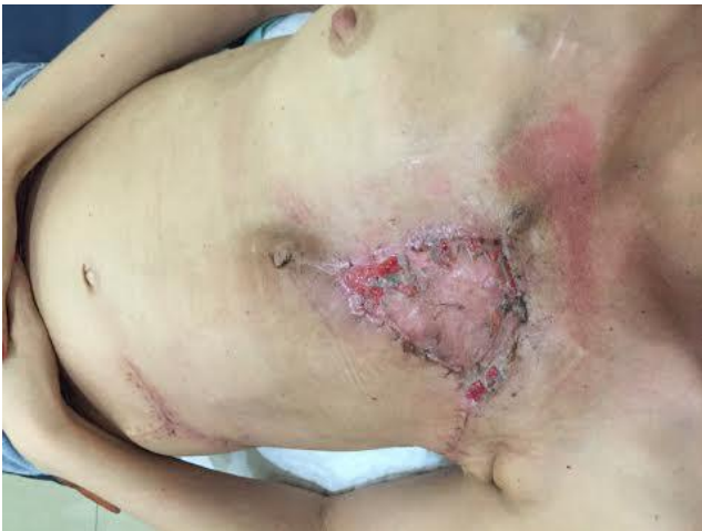
Figure 6: Wound healing after three weeks of operation

The TA flap was viable, and there was no complication (Figure 6). The wound was well healed after two months of the operation (Figure 7).