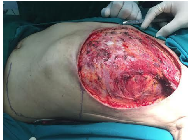
Figure 3: Wide defect of skin and soft tissue after radical mastectomy

Enlargement of the left lymph node was apparent and multiple. So, based on TNM staging, she diagnosed stage IV breast cancer (T4bN2M1). She continued with Docetaxel 65 mg/m 2 + Capecitabine about 2 cycles.