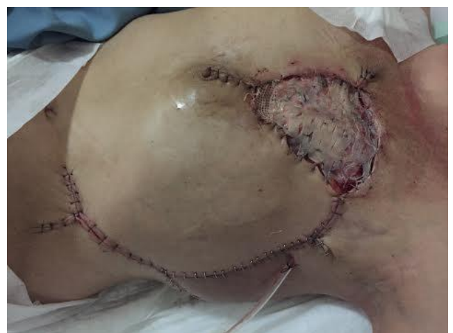
Figure 4: The defect was covered by TA flap and split-thickness skin graft on the medial side

Laboratory findings result in anaemia and hypoalbuminemia. We decided to perform palliative radical mastectomy to improve quality of life. Primary skin closure was not possible due to the wide defect of skin and soft tissue (Figure 3).