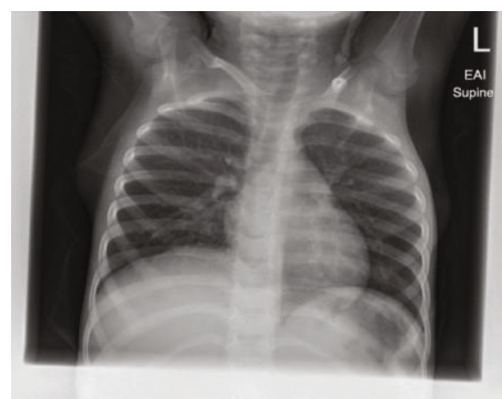
FIGURE 1: Chest X-ray showing an abdominal mass.

A 2D transthoracic echocardiogram demonstrated a large mass in the right atrium extending to the tricuspid valve without significant obstruction. Computed tomography (CT) of the abdomen showed a large 9.5 \times 11.5 \times 13.5 cm lobulated, mixed complex solid-cystic mass lesion, which was a predominantly hypodense solid lesion with heterogeneous cystic components and intervening thick septa occupying the left lobe of the liver and a large part of the right lobe (segments 5 and 6) and caudate lobe. It extended superiorly above the diaphragm as a well-demarcated 2.5 \times 3 cm mass at the cardiophrenic angle dipping into the right atrium