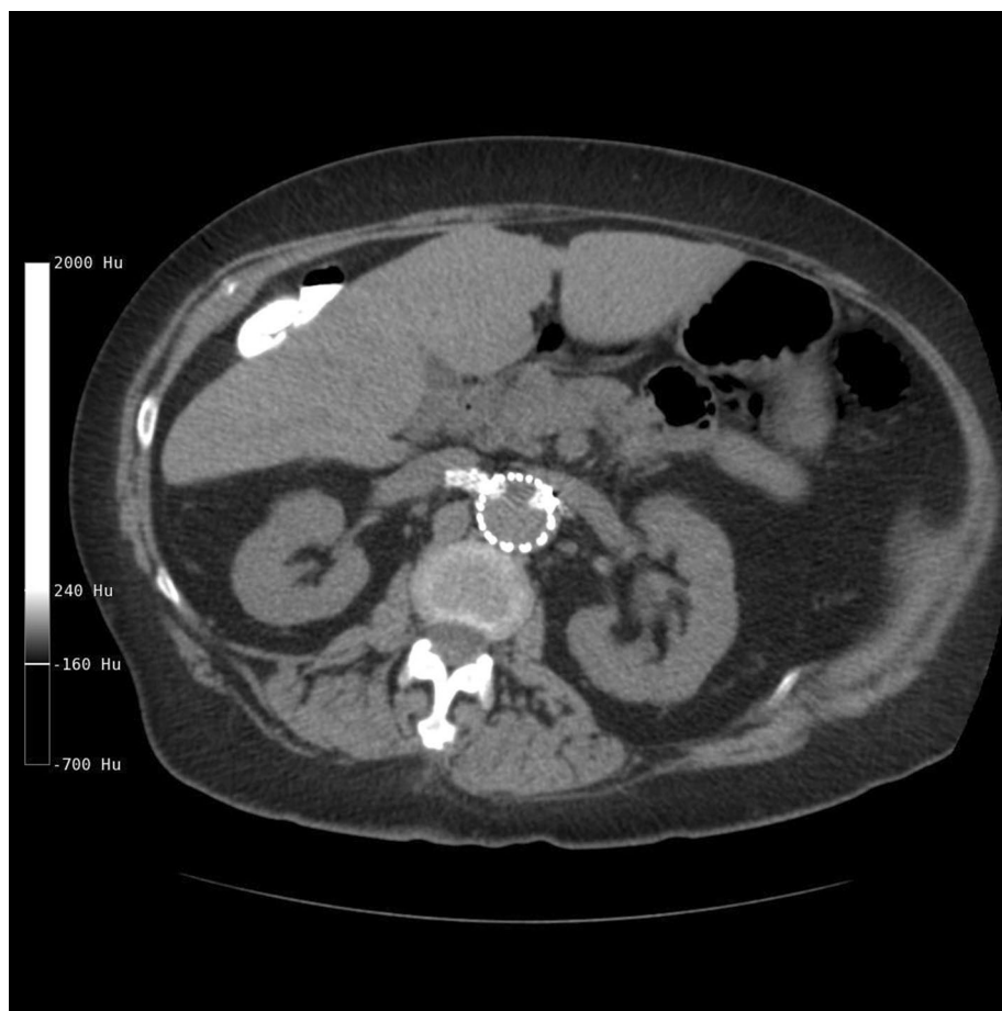
Figure 2 Repeat CT at 4 months post discharge showing complete resolution of the hepatic abscess.

The liver is a major site of intraabdominal abscesses (Altmeier et al. 1973). However, it is not clear why the liver seems to be preferentially affected over other visceral organs by F. nucleatum . While this could just be due to the liver's dual blood supply which is derived from the portal as well as systemic circulations, it is also possible that the formation of liver abscesses in Fusobacterium