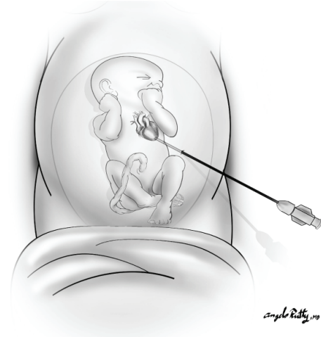
FIGURE 2: Illustration of the correct needle trajectory through the maternal abdomen and into the fetal left ventricle at the apex.

2.4. Laparotomy. If an acceptable trajectory was not available due to an unfavorable fetal position, a small lateral laparotomy incision was performed to allow manual repositioning of the fetus within the uterus and/or expose the uterus for direct trocar and needle puncture. This surgical procedure involved a vertical incision through the skin and subcutaneous tissues to reach the peritoneal cavity. Vascular structures were cauterized or ligated if transected. The peritoneum was then opened to visualize the uterus. Warmed, saline-soaked sponges were used to pack the intestine from the operative field. Sterile ultrasound gel and a sterile ultrasound transducer sheath were used on the uterine surface to allow ultrasound imaging of the fetus.