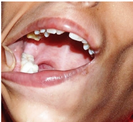
FIGURE 6: Fixed ceramic prosthesis irt 45, 46, 47.

lack of subcutaneous fat. Other major neurological abnormalities include sensorineural hearing loss, ataxia, spasticity, myoclonus, and gait disturbance; similar characteristic findings were noticed in the present case [6]. The usual oral findings are delayed deciduous teeth eruption, oligodontia, short roots, more incidence of caries, a deep palate, atrophy of the alveolar processes, mandibular prognathism, and condylar hypoplasia. We noticed macrodontia, fused incisors, and high arched palate in the present case [7]. Woodridge et al in 1996 reported difficult airway and intubation management and increased risk of gastric, later cachexia and accelerated