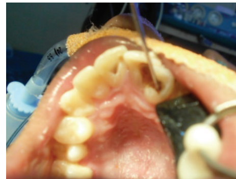
FIGURE 3: Deep dental caries irt 11 and fused crowns 21, 22.

according to Cormack-Lehane classification (1984) which shows likelihood of difficult intubation. After placement of appropriate monitors in the operating room, anesthesia was given using Ketamine and Propofol 2 mg/kg. We reverted to nitrous oxide gas instead of midazolam because of the effectiveness of the gas. Using nitrous oxide gas as a sedative agent, the dentist-anaesthetist could secure an intravenous route using a 24-gauge catheter and an infusion of dextrose 5% in 0.2% saline was begun. To prevent bradycardia atropine 0.01 mg/kg was given.