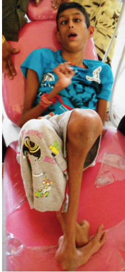
FIGURE 1: 14-year-old patient. Note is made of Sunken eyes, “bird-like” appearance, and lack of adipose tissue.

about the child at approximate age of 3 months because his head did not appear to be growing. The patient continued to experience a deceleration in growth rate in height, weight, and head circumference. He rolled over at 3 months but was never able to crawl, walk, or sit without support.