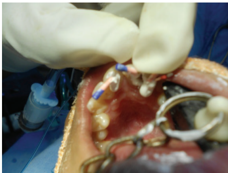
FIGURE 5: Root canal treatment irt 11, 21, 23.