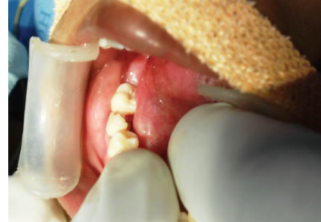
FIGURE 2: Grossly decay irt 46.

The patient’s parents reported to our department at the age of 14 with a chief complaint of pain in lower right back tooth region (Figure 1). An examination limited by poor cooperation revealed multiple gross carious lesions with poor oral hygiene. Intraoral findings showed deeply arched palate and the temporomandibular joint demonstrated a characteristic restriction of motion with teeth present 11, 12, 13, 14, 15, 16, 17, 21, 22, 23, 24, 25, 26, 27, 31, 32, 33, 34, 35, 36, 37, 41, 42, 43, 44, 45, 46, and 47. Among these 46 has been grossly decayed (Figure 2) and deep dental caries irt 11, fused crowns irt 21, 22 (Figure 3), cervical dental caries irt 14, 15, 24, 25 has been observed. Views obtained by direct laryngoscope scored grade 2 (half of the glottis seen, at worst only the posterior tip of arytenoids is seen)