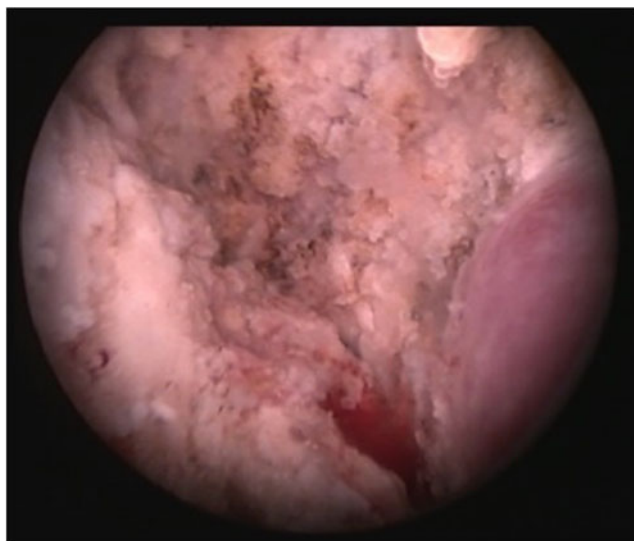
FIG. 1. Complete calcification of the prostatic resection cavity 5 weeks after initial TURP (veromontanum visible at the right picture margin). TURP = transurethral resection of the prostate.