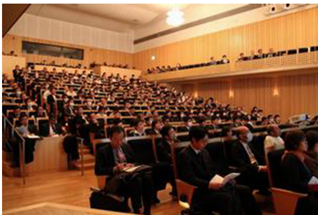
Fig. 3. Overview of the education meeting with city officers (big meeting).