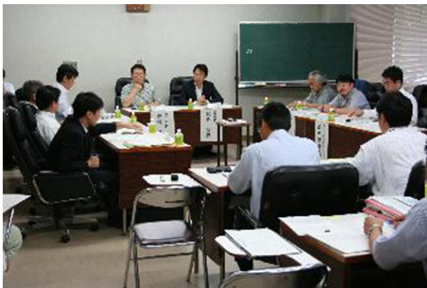
Fig. 2. Overview of the CRCT meeting (round table discussion).