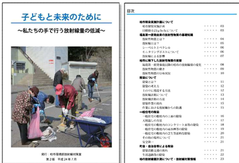
Fig. 4. Cover page of the guidance book for the official voluntary decontamination of Kashiwa city.

the city. Under their guidance, several active voluntary civic groups, NPO or NGO joined the process of assisting with getting citizen's requests into the action plan, wherever appropriate and possible. Led by the Decontamination Support Coordinator and the Decontamination Advisors, neighborhood associations started playing an active part in the voluntary decontamination work.