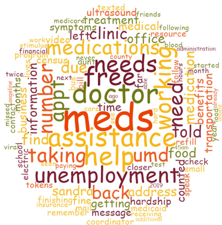
Fig. 3 Needs and Barriers Word Cloud. This word cloud shows the words used to express some of the barriers and challenges the participants were facing