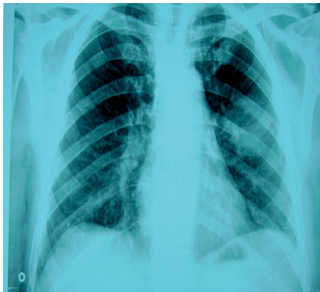
Figure 3 Case 3. Antero-posterior chest x-ray: image of condensation in the periphery of the middle lobe of the left lung.

Male, 45 years of age, with DS and hypercholesterolemia. He visited the emergency service reporting general malaise, arthralgia, myalgia, cephalgia, productive cough, high fever and chills. Physical examination showed good skin and mucous colour, good hydration, hyperemic pharynx, soft abdomen, not tender, no visceromegalies, no peritoneal reaction, respiratory auscultation: slightly decreased vesicular murmur in both lungs, no rales; cardiac auscultation: tachycardia. Vital signs: BP, 100/60; HR, 115/min; O 2 Sat, 94%; BG, 104 mg/dl; temperature, 39 °C. AP and lateral chest x-ray: condensation in the periphery of the middle lobe of the left lung (Figure 3). He is admitted to hospital, where a blood test was taken: leukocytes, 12.3 10 3 /μl; VSG, 36 mm; CRP, 1.8; coagulogram and D-dimer, normal; Na, 137 mmol/l; arterial blood gases: FiO 2 , 0.4; pH, 7.32; PCO 2 , 31; PO 2 , 65; CO 3 H, 24; O 2 Sat, 93%; normal urine analysis; negative tuberculin test. Sputum culture for bacteria, BAAR and fungi: negative. Negative serial blood cultures. Evaluation of immunoglobulin (IgM, IgG and IgA) was normal. Normal CD+ lymphocytes. Negative serology for Mycoplasma pneumoniae , Chlamydia psittaci , Chlamydia pneumoniae and Coxiella burnetii . The patient was diagnosed with CAP. After treatment with wide spectrum antibiotics, the