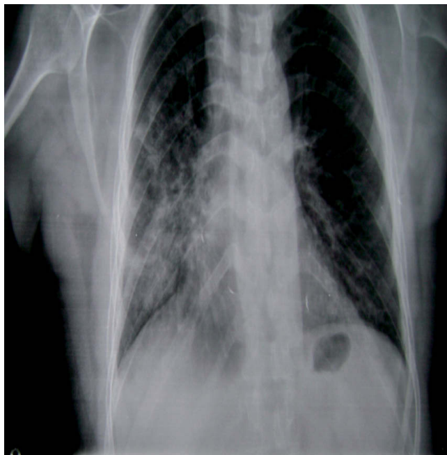
Figure 2 Case 2. Antero-posterior chest X-ray: bilateral alveolar-interstitial infiltrates, more pronounced in the right lung, with inflammatory lesions in the lower and middle lobes.

(60-280); IgG, 714.0 mg/dl (800-1,800); lowered CD4+ lymphocytes, serology for Mycoplasma pneumoniae , Chlamydia psittaci , Chlamydia pneumoniae and Coxiella burnetii IgM negative.