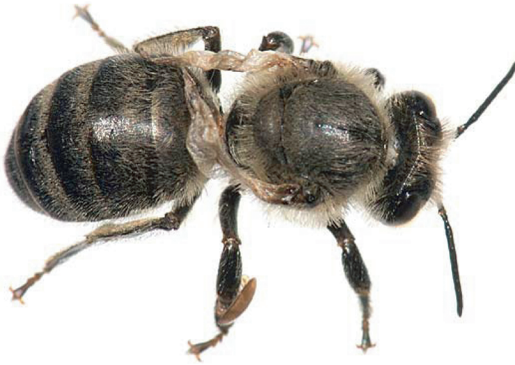
Figure 1. Non-viable, adult bee ( Apis mellifera ) exhibiting deformed wings as clinical symptom of an overt DWV infection. A V. destructor individual is still clinging to one of the legs. (A color version of this figure is available at www.vetres.org .)