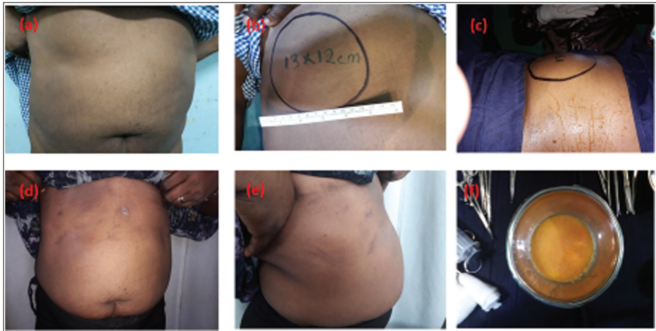
Figure 2: Pre- and postoperative pictures of one of the female patients: (a) preoperative anterior–posterior view showing the lesion on the right hypochondrium, (b) preoperative view in the supine position, (c) intraoperative view, (d) postoperative view in the antero-posterior plane, (e) postoperative view in the right oblique plane, and (f) yellowish lipo-aspirate from the patient

and Fournier, popularised the surgical suction device developed by Fischer. Following further refinements, this evolving technique became known as liposuction and was widely embraced by medical practitioners from various specialties. [19] Throughout this period, liposuction surgery was mostly performed under general anaesthesia. But in 1987, a dermatologist named Jeffrey Klein first reported the use of large volumes of very dilute anaesthesia, which allowed significant liposuction to occur using only local