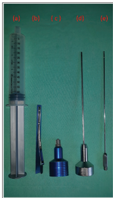
Figure 1: Manual liposuction set: (a) aspiration syringe, (b) syringe lock, (c) syringe luer adapter for infiltration cannula, (d) aspiration cannula, and (e) tumescent infiltration cannula

The lipo-aspiration was done with a 4-mm cannula connected to a manual 60-mL luer-lock syringe with a stopper for negative pressure [Figure 1]. The basic concept is that fat lobules are bluntly broken down, curetted by a cannula, and removed through the cannula's aperture by a vacuum force generated from a suction syringe. One or two stitches were applied with a 4/0 nylon suture to the incision sites after aspiration. Firm pressure dressing was applied over each site to prevent seroma or haematoma