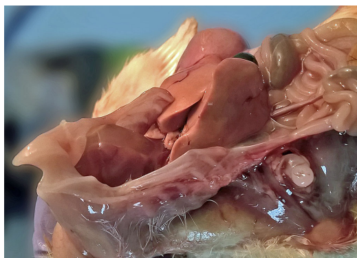
Figure 2. Pale and friable liver of 2-day-old intoxicated turkey poul after the ingestion of wood shavings contaminated with copper sulfate.