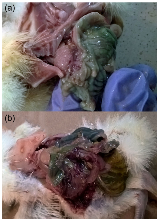
Figure 1. Dark green lining of the gizzard (a) and deep erosions of the gizzard mucous membrane (b) of 2-day-old intoxicated turkey poul after the ingestion of wood shavings contaminated with copper sulfate.