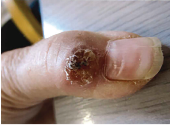
Fig. 1: Appearance of lesion at presentation to the clinic.

be easily dissected from the surrounding tissue. The histopathology evaluation was suggestive of a cystic lesion lined by squamous epithelium and suggestive of an inflamed pilar cyst. There was no recurrence at her 3 month follow up and the operative site had healed well.