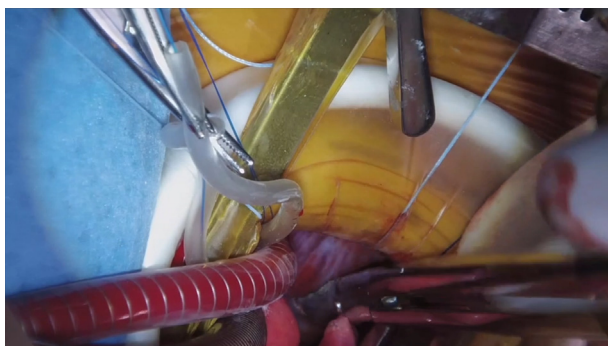
VIDEO 1. Video demonstration of the RVIAT approach for DCVSD closure. Video available at: https://www.jtcvs.org/article/S2666-2736(23)00173-0/fulltext .

in the RVIAT group, which explains why the mean prebypass surgical time was longer in the RVIAT group than the MSA group ( P = .03 ) and indicates the possibility of a more difficult preparing cannulation via the thoracotomy approach. However, our operation results showed that there were no significant differences between groups in bypass time ( P = .21 ), aortic crossclamp time ( P = .08 ), and operation time ( P = .59 ). In our study, the oldest patient was 15 years old (46 kg), and some patients were older than age 10 years. Approaching the DCVSD through the main pulmonary trunk via RVIAT was much more challenging in these patients than in infants because of the larger thoracic depth and deeper surgical field created by the pulmonary artery's location on the left side of the thorax, which did not reflect the learning curve. We recommend starting the RVIAT approach of DCVSD closure for a patient with a body weight of approximately 7 to 8 kg to obtain better visualization and easier cannulation.