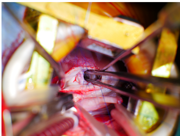
FIGURE 1. Exposure of the doubly committed ventricular septal defect (VSD) via the right vertical infra-axillary minithoracotomy (RVIAT) approach.

described as for the RVIAT group. The sternum was closed after 2 drains were inserted into the pericardium cavity and the mediastinal cavity.