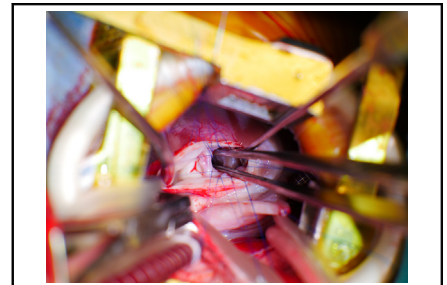
DCVSD closure via the RVIAT approach.

Conclusions: Closure of doubly committed ventricular septal defects through the pulmonary trunk by the RVIAT approach is feasible and safe, and does not increase the risk of bypass-related complications. (JTCVS Open 2023;15:368-73)